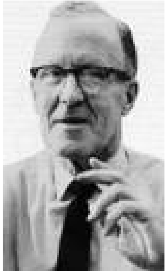
Donald Hebb, 1970

psychological torture. With funding from Canada’s Defense Research Board, famed Canadian psychologist Dr. Donald O. Hebb found that he could induce a state akin to psychosis in just 48 hours. What had the doctor done—drugs, hypnosis, electroshock? No, none of the above.