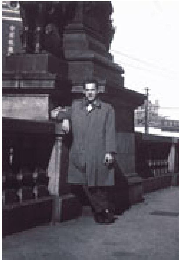
Donald Richie at Nihonbashi in 1947.

He saw Ginza when it was a blackened plain but for the bombed-out Mitsukoshi department store, the Hattori Building and a handful of other structures left standing. He observed the city as it was rebuilt, and its people. He observed, and then he wrote.