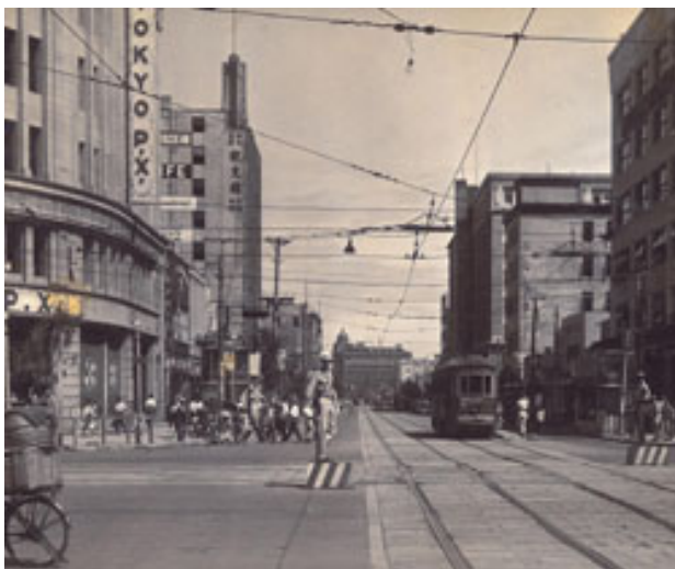
U.S. MP directs traffic in Ginza without cars in about 1947.

When you first get there everything seems different. The assumptions that people work on are not those you grew up with. You learn a different method of thinking. I still wake up in the morning wondering what I'm going to learn today. And I always learn something; I watch someone doing something and suddenly understand why, by putting everything I've learned before together. When I first came, it was daily. The first time I saw geta [wooden sandals], I didn't realize you were supposed to wear them on your feet. What you learn becomes more subtle, more sophisticated, the longer you stay; but the process is the same.