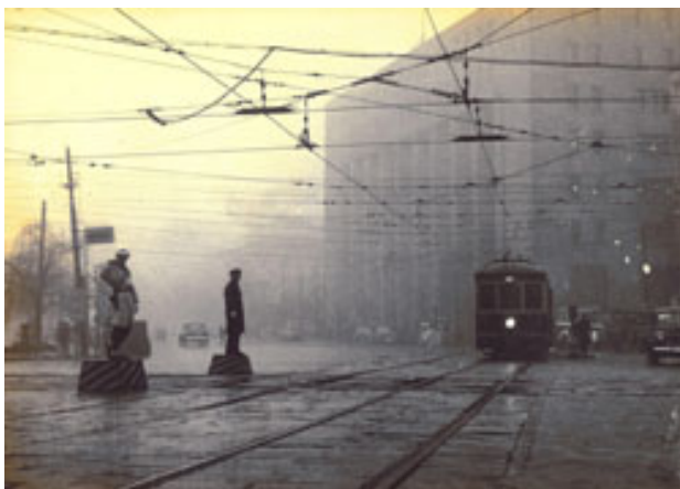
Fog shrouds U.S. Gen. Douglas MacArthur's headquarters in the Dai-Ichi Seimei Building in Hibiya.

Mishima was, for his time and country, fairly open. When two stamp collectors get together, they have a certain camaraderie. They know the subject, and they can be at home with each other. It was that way with Mishima and me. We really never talked about the subject; but it was assumed that we knew.