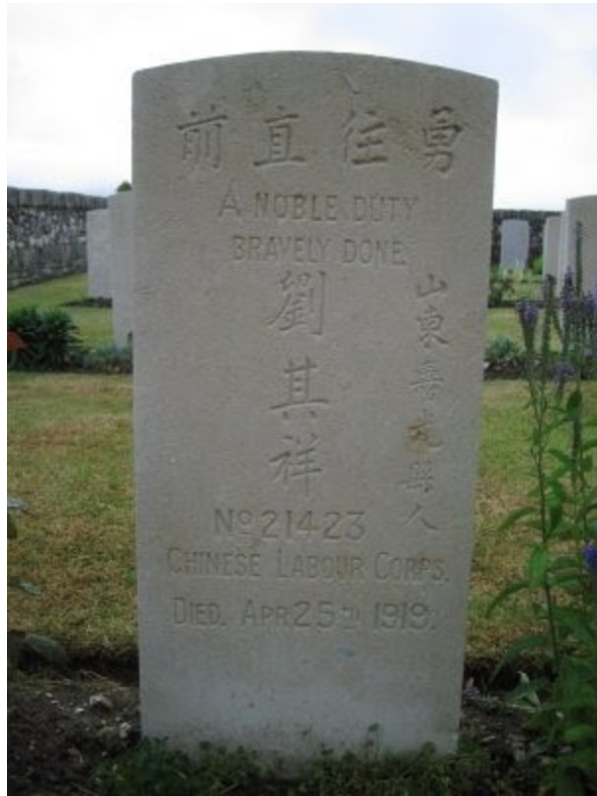
Tombstone of a CLC member, a physical reminder of their legacy

WWI, Great War, CLC, Chinese Labour Corps, Nation-Building, Versailles