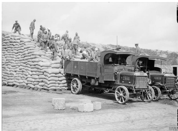
Cap badge of the Chinese Labour Corps CLC personnel moving sacks of corn at Boulogne, on 12 August 1917