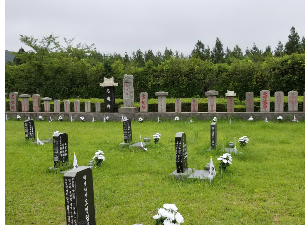
Namwon-eup Cemetery for the loyal dead.

Also in Namwon-eup in which Uigwi Village is located, Namwon-eup Cemetery for the “loyal dead” was established in 1991. Those buried here were generally members of the state punitive forces—the police, military, public officials, and others who died as members of paramilitary groups—during the 4.3 massacres. One tombstone reads: “died during the cleanup operation of communist guerillas in Mt. Halla.” The cemetery is easily accessible since it is located right by one of the few main roads leading to Mt. Halla. The tombstones are aged but grand, and the more recent ones are a shiny black marbles. A high tower stands in the middle of the cemetery, and the national flag of South Korea flutters on a pole right next to it. The national flag is easily spotted throughout the cemetery; some tombstones have the flag engraved on them, and an artificial chrysanthemum and a miniature flag are neatly