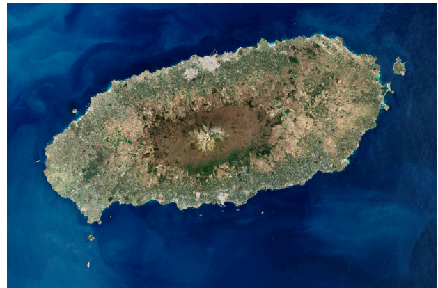
Cheju island: Robert Simmon, using Landsat data provided by the United States Geological Survey. Earth Observatory . From Wikipedia (Public Domain).

Keywords: Cheju 4.3 Incident; artists/activism; Cold War; decolonization; personal narratives; the archipelagic