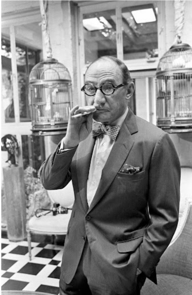
[Joseph Alsop in 1974. ]

This timely visit recalls others. Alsop visited Taiwan and Indochina in late 1953, as the French were making their fateful buildup at Dienbienphu; he was the first to report USAF support for Dienbienphu before announcing his conversion to Chiang's and Macarthur's view that "there was no substitute for victory" in Asia. 23