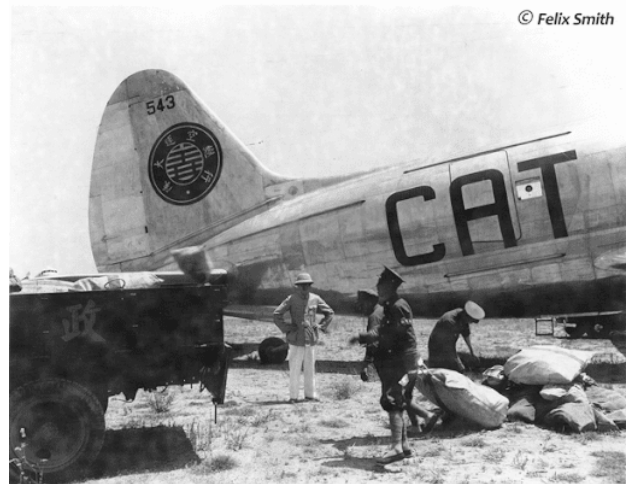
[Mail being loaded onto a CAT plane. ]

At first, UNRRA Director LaGuardia turned down this proposal after he and all other responsible UNRRA officials opposed it as wasteful and unnecessary. However, LaGuardia "was called in for consultation by the State Department and told that both Soong and Madame Chiang had insisted on the need for the airline. LaGuardia reversed himself." 33 The Kuomintang clearly wanted Chennault to stay on to support its widely scattered armies; and indeed when Chennault "got full support of the line, he used it in semi-military support of the Kuomintang." 34