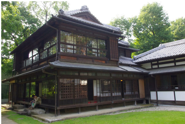
Figure 20: Takahashi Korekiyo's former house was moved to an outdoor museum in Koganei. He was killed while sleeping in an upstairs bedroom.

Takahashi's former residence became a memorial park next to the Canadian Embassy in Aoyama. The house in which he was slain still stands, and can be visited at the Edo-Tokyo Open Air Architectural Museum in Koganei City.