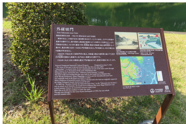
Figure 2: Bilingual signboard at Sakuradamon gate.

On March 24, 1860 Tairo (great elder) Ii Naosuke, the most powerful official in the Tokugawa bakufu, was approaching the Sakuradamon gate of Edo castle when his retinue was attacked by a troupe of 17 shishi ("men of high purpose") from the Mito domain (and one from Satsuma). A heavy snow was falling, and the oilskin protective clothing worn by Ii's guards made it difficult for them to draw their swords quickly. During the bloody melee, Ii, age 44, was dragged out of his palanquin and decapitated.