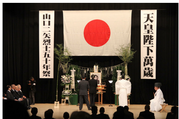
Figure 23: Fifty years after his act, Yamaguchi Otoya supporters held a memorial ceremony on the stage of Hibiya Public Hall where he killed Asanuma.

Fifty years to the day of Asanuma's assassination—on October 12, 2010—the Otoya Yamaguchi Appreciation Society held a ceremony to commemorate Yamaguchi's "heroic" act.