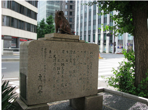
Figure 14: Memorial near Toramon subway station where Crown Prince and Regent Hirohito was targeted by an assassin in December 1923.

the Toranomon intersection while en route to a Diet session. Hirohito was unharmed.