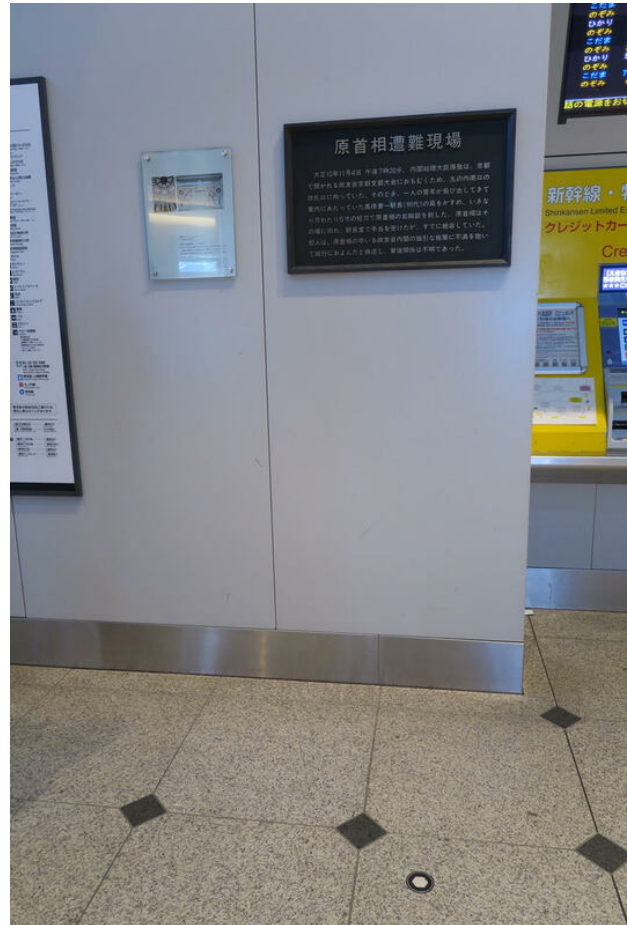
Figure 16: Small white hexagon on the floor of Tokyo Station (Marunouchi South Exit) indicates where PM Takashi Hara was standing at the moment he was slain. Explanation is posted on the wall behind it.

During the first three decades of the 20th century, the prime minister of Japan became a high-risk occupation. A plaque under the rotunda of the Marunouchi South Exit indicates where Prime Minister Hara Takashi (65) was stabbed to death by a railway worker on November 4, 1921. A second, mounted on a pillar close to the wicket of the Tokaido Shinkansen, indicates the spot where, on November 14, 1930, Prime Minister Hamaguchi Osachi was shot by a member of an ultranationalist secret society.