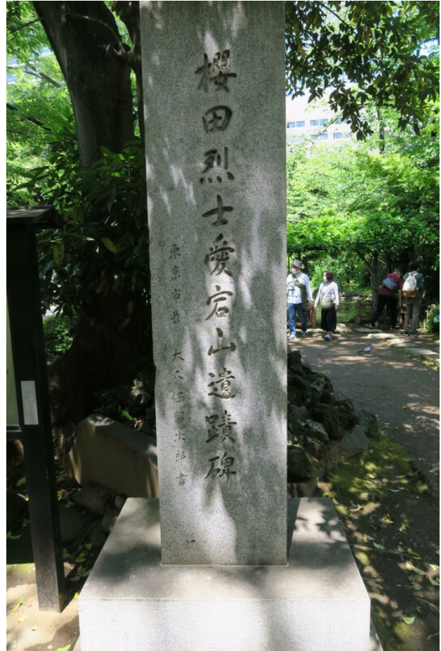
Figure 4: Monument to Ii's assassins, who converged at the Atago Shrine before embarking on their bloody quest.

Romulus Hillsborough's 2017 work, Samurai Assassins: "Dark Murder" and the Meiji Restoration, 1853-1868 explains the background, circumstances and description of the Sakuradamon Incident. The book also details the unsuccessful attempt on the life of Ando Nobumasa, Ii's successor, in a similar attack outside the Sakashita gate of the castle on February 13, 1862.