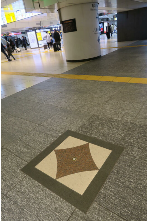
Figure 17: Square in Tokyo Station indicates where PM Isachi Hamaguchi was standing when attacked in 1930. The details are explained on the pillar in the background.

Hamaguchi had infuriated opponents of the London Naval Treaty, which he had supported as an austerity measure to deal with Japan's economic crisis. He lingered for nine more months but never recovered from his wounds, passing away at age 61.