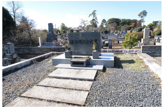
Figure 22: Asanuma's grave in Tama Cemetery, west Tokyo.

Fifty years to the day of Asanuma's assassination—on October 12, 2010—the Otoya Yamaguchi Appreciation Society held a ceremony to commemorate Yamaguchi's "heroic" act.