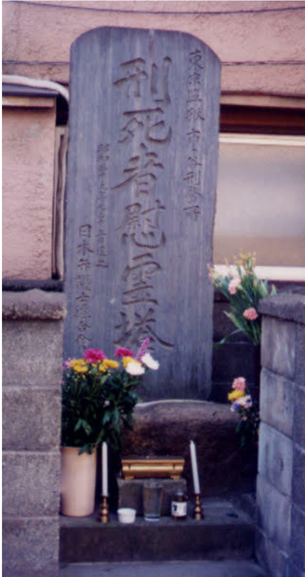
Figure 11: Monument erected by the Japan Bar Association at the site of the gallows at the former Ichigaya Prison, where Kotoku Denjiro and 11 other anarchists were hanged for plotting to assassinate the Meiji Emperor.