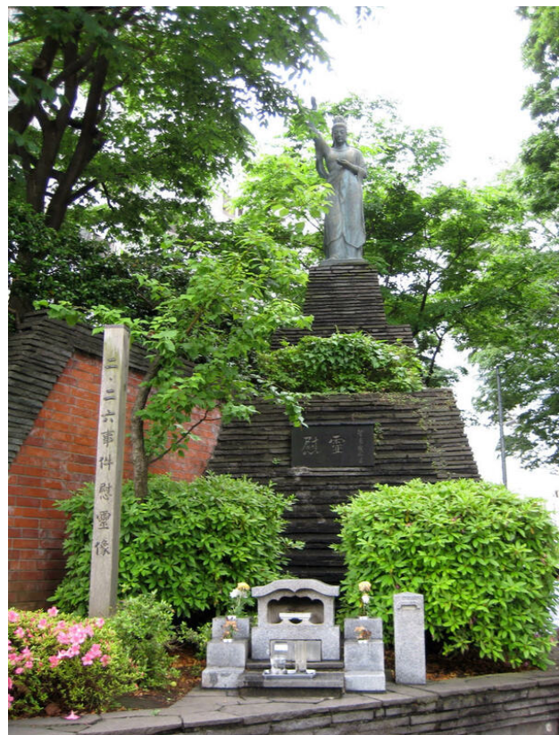
Figure 19: Statue of the goddess Kannon erected on the spot in Shibuya where the Feb. 26 assassins and their leaders were executed.