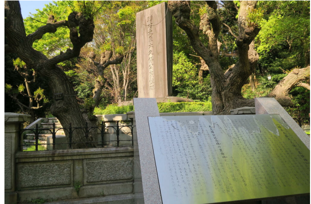
Figure 9: Monument at the site of Okubo Toshimichi's assassination in May 1878.

Japan's restoration to imperial rule from January 3, 1868 would eventually leave a large class of disenfranchised samurai, resentful over the loss of their power and class privileges. On May 14, 1878, the carriage of Lord of Home Affairs Okubo Toshimichi was attacked by a group of ex-samurai from the Kaga domain (Ishikawa Prefecture). The 47-year-old Okubo, a native of Satsuma (Kagoshima) and remembered as one of the three great nobles who led the Meiji Restoration, was literally cut to ribbons and died on the spot. The monument to Okubo and an explanatory bilingual signboard are situated in Shimizudani Park in Kiyoi-cho, directly across the street from the Hotel New Otani.