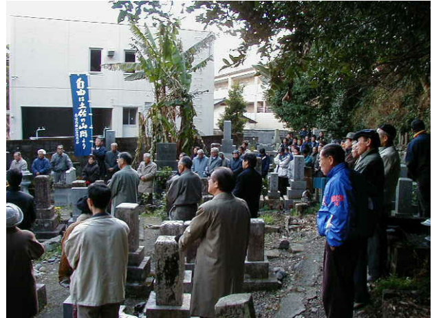
Figure 12: Nakamura City residents flock to Kotoku's grave each year on the anniversary of his execution.