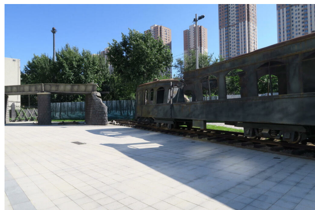
Figure 15: Actual size reproduction of the train in which Zhang Zuolin was assassinated by members of Japan's Kwantung Army at Huanggutun, Shenyang (formerly Mukden) in June 1928.

In the early morning hours of June 4, 1928, members of the Japanese Kwantung Army attached a powerful bomb to the underside of a railway trestle at Huanggutun, an intersection of two rail lines just outside of the old Manchu capital of Mukden (present-day Shenyang). As the train carrying Manchurian warlord Zhang Zuolin passed underneath, the device was set off, killing Zhang as he sat in his private rail car playing mahjong.