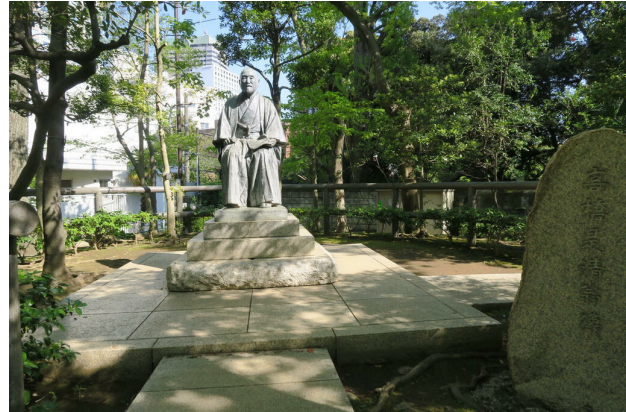
Figure 18: Statue of Takahashi Korekiyo at the site of his former residence in Aoyama.

The four important figures assassinated that day included 81-year-old Minister of Finance Takahashi Korekiyo who had previously served as president of the Bank of Japan and prime minister. At gunpoint, a servant led two officers into his bedroom, where they killed Takahashi as he slept.