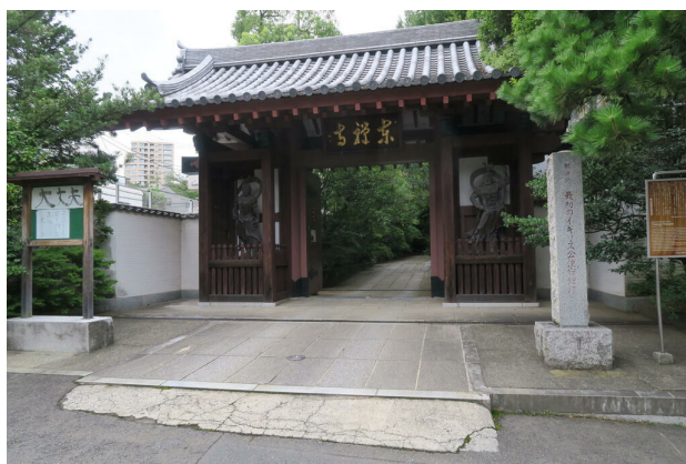
Figure 6: Gate of the Tozenji temple, site of Great Britain's first legation in Edo where Kobayashi Denkichi was assassinated.

On January 29, 1860, Kobayashi Denkichi, interpreter to the British legation, was fatally wounded by two samurai outside the gate of the Tozenji temple in Takanawa, just off the Tokaido road linking Edo to Kyoto. The Wakayama native's fishing boat had gone adrift when he was rescued by an American vessel and taken to San Francisco, where he learned English. He later traveled to Hong Kong, acquired British nationality and accompanied Great Britain's first ambassador, Sir John Rutherford Alcock, to Japan in 1858.