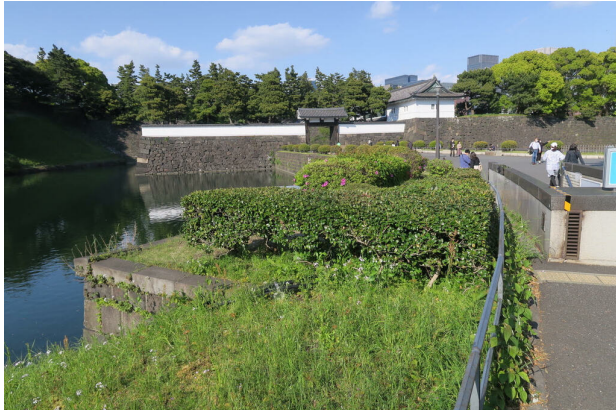
Figure 3: The Sakuradamon gate as it appears today.

Two years earlier, Ii had ordered the Ansei Purge, jailing, exiling and in some cases executing 100 individuals suspected of disloyalty to the Tokugawa government. The killers also objected to Ii's having negotiated, and in July 1858 signed, the Treaty of Amity and Commerce between Japan and the United States, as well as subsequent treaties with European powers.