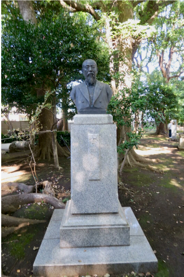
Figure 1: Bust of Ito Hirobumi at his grave in Shinagawa, Tokyo.