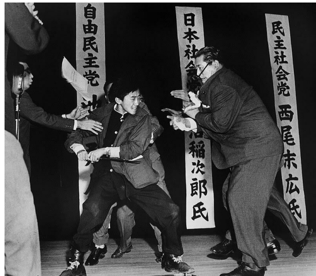
Figure 21: Prizewinning photo shows the already mortally wounded Asanuma attempting to ward off his assailant's second attack.

The following year, Mainichi Shimbun photographer Nakao became the first Japanese to be awarded Pulitzer Prize for his photograph, which captured the physically imposing Asanuma—already mortally wounded—extending his hands in a futile attempt to ward off the diminutive Yamaguchi's second thrust.