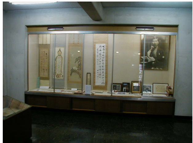
Figure 13: Kotoku memorabilia on display at the public library in his home town of Nakamura City, Kochi Prefecture.

Kotoku's execution was to have repercussions 13 years afterward, when on 27 December, 1923, Namba Daisuke, son of a Diet member from Yamaguchi, fired shots at the carriage carrying Crown Prince and Regent Hirohito at