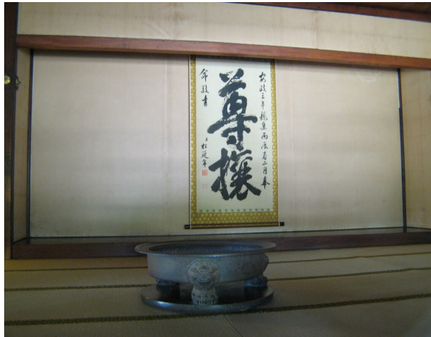
Figure 8: “Sonjo” scroll hanging at the Kodokan academy in Mito, where young samurai were imbued with the slogan “Sonno Joi” (revere the Emperor and expel the barbarians).

Japan's restoration to imperial rule from January 3, 1868 would eventually leave a large class of disenfranchised samurai, resentful over the loss of their power and class privileges. On May 14, 1878, the carriage of Lord of Home Affairs Okubo Toshimichi was attacked by a group of ex-samurai from the Kaga domain (Ishikawa Prefecture). The 47-year-old Okubo, a native of Satsuma (Kagoshima) and remembered as one of the three great nobles who led the Meiji Restoration, was literally cut to ribbons and died on the spot. The monument to Okubo and an explanatory bilingual signboard are situated in Shimizudani Park in Kiyoi-cho, directly across the street from the Hotel New Otani.