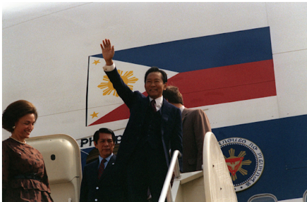
Figure 2: Ferdinand Marcos pauses to wave to the people waiting to welcome him as he arrives for a visit to Washington DC, 1983.