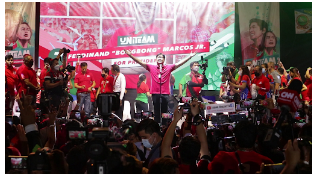
Figure 1: Campaign closure speech by Ferdinand ‘Bongbong’ Marcos, Jr.

Keywords: Philippines, Rodrigo Duterte, Ferdinand Marcos, Elections, Colonial History