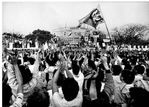
Figure 3: A photo from the People Power uprising in 1986.

The third legacy of the Marcos years was the fracturing of the military. Racked by corruption and favouritism, the officer corps was split between Marcos’ cronies who benefitted from his wealth and power, and disillusioned and highly professional soldiers who held the latter in contempt and had sought to overthrow Marcos. Divided, demoralised, and politicised, the military found itself fighting a two-front war: the communists and the Muslim separatist rebellion in the south. To remedy their weakness, they began to rely on paramilitary groups and volunteer militias that they armed and paid for. Let loose on the population, such undisciplined forces terrorised towns and preyed upon their residents, quickly devolving into death squads and vigilantes. In addition, the faction in the military who called themselves the Reformed Armed Forces Movement (RAM) had triggered the coup attempt against Marcos that led to the People Power uprising. In the wake of the Marcos dictatorship, they would launch a series of coups seeking to topple Aquino’s government between 1987 to 1989.