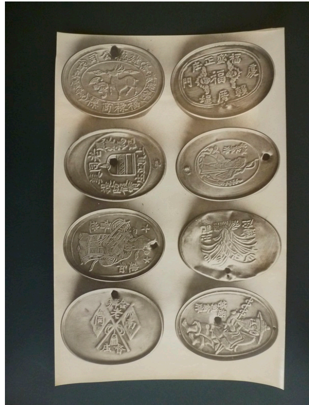
Figure 3: Opium Tins from China Confiscated in the Netherlands Indies, 1930.

An unintended consequence of this confluence of policies across neighboring regimes was the empowerment of a wealthy and savvy transnational opium investment network. Over the 1860s, 1870s, and 1880s, intense competition raged across southern China and Southeast Asia between the same groups of opium investors, as they either took over state tax farms or slipped into smuggling when the contracts were awarded elsewhere. These were also the decades during which opium cultivation expanded most rapidly across the Qing Empire, producing by the 1880s tens of millions of chests of the drug each year.