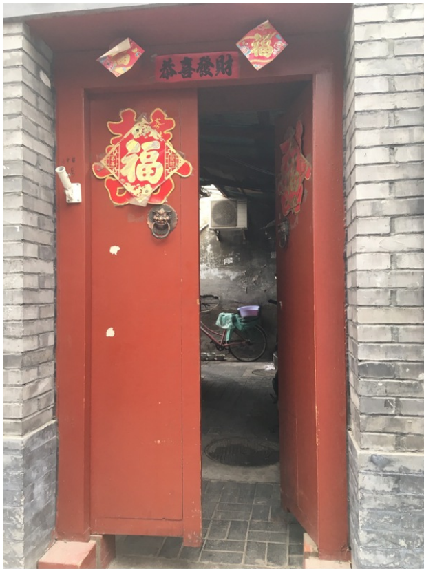
The entry to a residential courtyard in the hutong near Houhai

In my story, the provincial rogue who pursues the lovely but elusive Huamei is very much in the Gatsby mold. He breaks out of the prison-like confines of a rural work farm in Inner Mongolia, and, in cahoots with corrupt police, engages in blackmail while operating a string of lucrative entertainment venues. In keeping with Beijing's tacit segregation of types of people and types of activity, his flashy world of discos, karaoke joints and private clubs is situated on another square of the giant chessboard, namely Sanlitun, a zoned diplomatic district in the tradition of the old walled Foreign Legation, one of those hybrid areas in which Chinese and foreigners could mix relatively freely in the 1990s, at least up to a point, after which the rise of exclusive clubs created new forbidden zones.