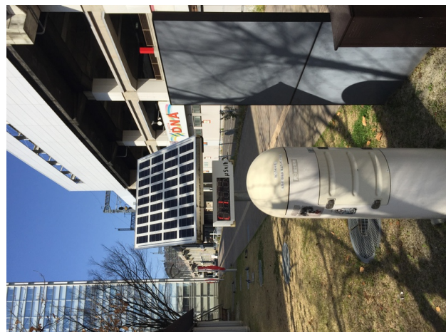
Fig. 2: Fixed station radiation monitor post.

All of us have been dealing with the horrors and the terrors of the COVID-19 pandemic since early 2020. Viscerally, we feel the anxieties and fears that accompany uncertainty about dire risks to our lives and loved ones. Being cautious about our public activities in the age of COVID makes intuitive sense. We navigate our potential exposures, work to mitigate our potential contaminations, and worry endlessly about loved ones with health concerns. Each small, unrelated medical symptom a family member exhibits is met with anxiety. This is a reality for people worldwide. Those who live in areas dense with radionuclides face similar anxieties: the locations of the risk are indeterminable; who is being exposed and who is safe is unclear, even while the damage is inflicted; daily life is rife with anxiety. But in radiologically contaminated communities it is not conspiracy theorists on social media dismissing them as irrational, it is state health officials. They draw maps, based entirely on externally measured levels of radiation, and use those maps to tell people to move back to villages where the levels of contamination are “acceptable,” to send their children to schools and move back to towns where the presence of radioactive particles is not dense enough to register on Geiger counters placed high above the ground.