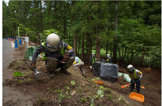
Fig. 3: Decontamination crew works to decontaminate a roadside in Iitate in 2015. Almost certainly the particles in the forest canopy and on the trees will re-contaminate this roadside within a year.

The reduction in radiation levels is the predicate for declaring towns safe for return. The particles themselves remain radioactive; the fields filled with plastic bags of particles stacked around the region are now nuclear waste sites that must be managed for generations. The theatrical aspect is in pretending that by removing the radioactive particles from the towns they are now “clean.” Since the towns are themselves situated in larger ecosystems full of radionuclides, this “decontamination” cannot last: wind, rain, typhoons will all strip particles down from the forests and mountains surrounding the towns and re-contaminate them. Similar to how the Tokyo 2020 Olympics were meant to produce the impression that Fukushima has recovered, all theater requires the willing suspension of disbelief. When we placed a containment dome over the melted core of Chernobyl reactor unit #4 people assumed that the Chernobyl disaster