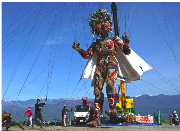
Fig. 2: “Dreams of Fevered Imaginations”: MOCCO, the Fukushima Reconstruction Puppet.

By the time the Olympics were actually staged, the Japanese authorities had gone down a convoluted path of trying to manage a message that would sanctify the games and burnish Japan’s reputation. Originally this was directed toward the powerful associations attached to the “Fukushima Olympics,” which in the runup to the games was a central concern. Later, this would be almost entirely eclipsed by the COVID pandemic.