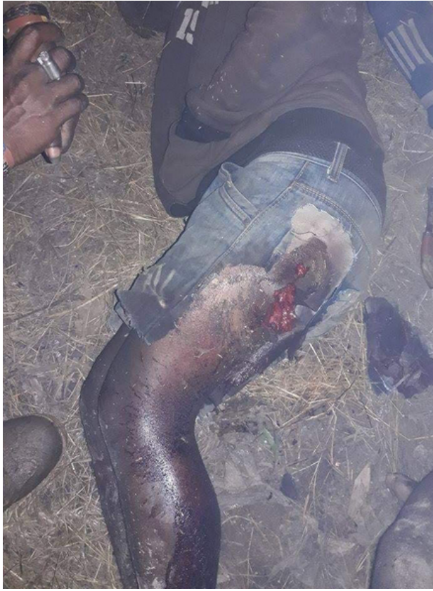
Figure 2: Alleged white phosphorus burn to a Nduga resident's leg.