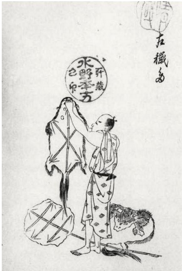
"Eta" in Edo shokunin utaawase , Ishihara Masaakira

particular status (in this case kawata / eta / chōri) and of its relationship with authorities, regardless of whether there were instances in which individual villagers did not engage in that particular activity.