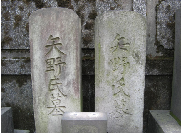
Danzaemon family gravestones bearing the surname Yano at Asakusa's Honryūji Temple

Plainly the lives of kawata / eta / chōri could be and were valued differently to other members of the population during the early modern period and they were treated differently because of this evaluation. Perhaps the most blatant form this could take was to value the life of members of the kawata / eta / chōri communities differently than others, including the lives of peasants. Examples can be found across many regions. In Kōzuke province, for example, a clash occurred in 1839 that started with a chōri (kawata / eta) and a peasant drinking together and the latter reportedly insulting the former: “Even if I killed seven eta, I would only need to offer up one white dog for execution in return.” 26 What began as a discriminatory utterance rapidly escalated into a dispute between the respective chōri and peasant villages that needed to be mediated by the local bannerman’s representative. In the Tenpō era (1831-1845), “eta hunt/s” ( etagari ) took place that targeted kawata for “exposure” when they attempted to pass as members of non-outcaste society. 27 While it is impossible to pinpoint the underlying motivations of the perpetrators of violence and discrimination in each and every case, the idea that kawata / eta