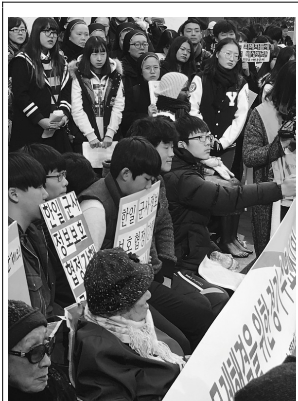
Wednesday Demonstration outside the Japanese Embassy in Seoul, with the 'Statue of a Young Girl' centre-stage

official apologies (without any public restatement from Abe); on the other, within Japan, efforts continued to expunge mention of comfort women from school textbooks and wider public discourse within Japan. 27