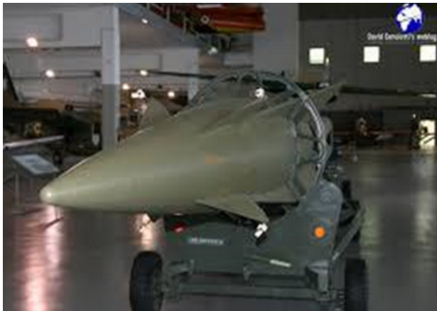
Nike-Hercules warhead, conventional version. Nuclear version was white.

Stored with the Honest John rockets at the Army's ordnance base in Henoko were Nike-Hercules surface-to-air anti-aircraft missiles with nuclear warheads. They were deployed on hilltops and at airfields in Okinawa. In 1959 one of the Nike-Hercules missiles at Naha Airbase fired accidentally killing two Army crewmen and injuring one. The warhead bounced out and rolled on the ground, but did not detonate. Soldiers in Okinawa worried about the Nike Hercules. Although it was capable of destroying a squadron of Soviet MiGs, a nuclear explosion in the air would release radiation endangering everyone on the ground.