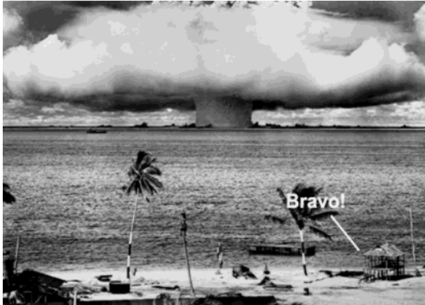
“Bravo Shot” H-bomb test, Bikini, March 1, 1954