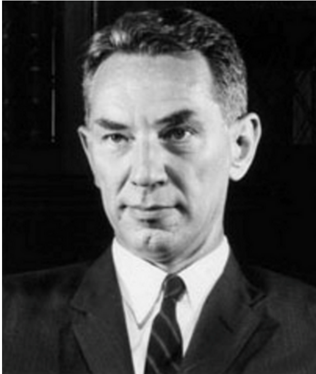
Edwin O. Reischauer, U.S. Ambassador to Japan, 1961-66