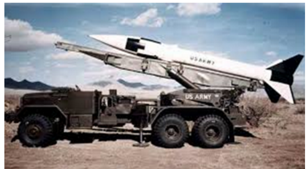
Nuclear-capable Honest John rocket on its truck-transported launcher.

Although the subsequent presence of nuclear weapons in Okinawa was supposed to be highly classified information, anti-nuclear protests that greeted the arrival of Honest John rockets showed that they were hardly a secret to Okinawans. How could local residents not be suspicious of the extremely high security at the Army's ordnance storage base at Henoko where squads of armed soldiers with German Shepherd sentry dogs patrolled its perimeter 24/7, where signs along the main road passing it ordered "no stopping," and where a large area of close-cropped grass surrounded by high-wire fencing contained several oblong, sod-covered concrete bunkers with steel doors? They could easily find out that the base's "SW" designation on the sign at its entrance gate stood for "special weapons"--nuclear, chemical and biological. Among Okinawans inclined to do some research into nuclear issues, a book published in mainland Japan about the U.S. military in Okinawa noted that an unclassified Army manual describing the base's organization listed a "nuclear ordnance platoon." 9