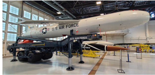
Mace-B surface-to-surface guided missile.

Along with the nuclear strategic bombers at Kadena airbase, nuclear-armed Mace-B surface-to-surface missiles arrived in 1961 with a range capable of attacking all of China and the Soviet Far East. An erroneous launch order issued to Mace-B crews during the Cuban Missile Crisis of October, 1962, came close to starting a nuclear war. 12