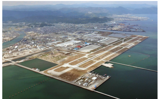
Marine Corps Air Station Iwakuni with port and airfield.

Because of the special relation of the Marines to the Navy, there was a flat-bottomed ship for landing tanks on the beach (LST, for Landing Ship, Tank), anchored just offshore Iwakuni with nuclear weapons aboard, loaded onto amphibious tractors, just for the small group of planes on this base.