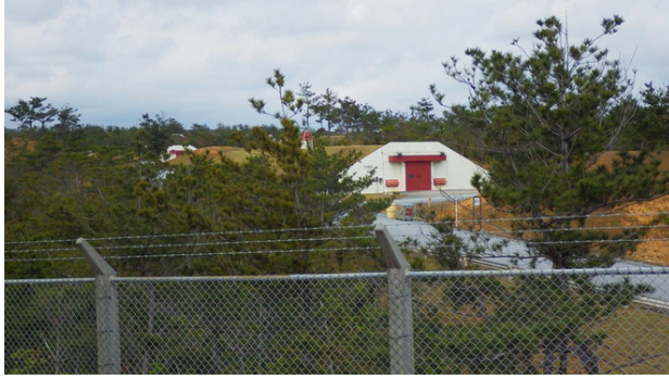
Storage “igloos” at the Army ordnance company in Okinawa that stored nuclear weapons until 1972.