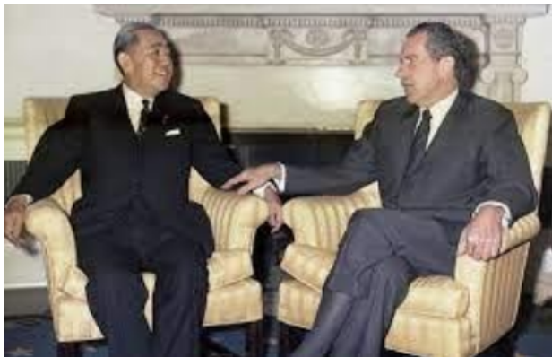
Prime Minister Satō and President Nixon at the White House in November, 1969

By the mid-1960's protests in Okinawa against the U.S. occupation and its nuclear-armed bases were beginning to interfere with the functioning of the American military mission. Mass demonstrations, including sit-ins at base gates and occupation headquarters, demanded a return of Okinawa to Japanese sovereignty, reduction of the U.S. military presence, and the removal of nuclear weapons. Beginning in 1967, negotiations led to the "Okinawa Reversion Agreement" between U.S. President Richard Nixon and Japan's Prime Minister Satō Eisaku, concluded in November, 1969.