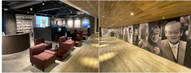
Zone 3. Video screens, wall panels, Liquid Galaxy, book shelf, and reading area (left) and Selected photographs of testimonies (right).

who would have had no interaction with wartime forced laborers.