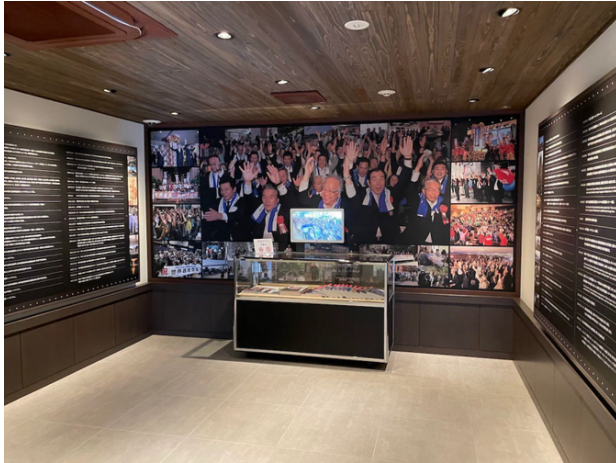
'Celebration room' showing timeline leading to the inscription of the Sites of Japan's Meiji Industrial Revolution. From UNESCO/ICOMOS July 2021 report, pp. 42.