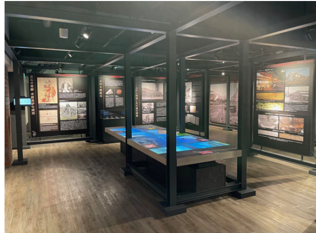
Zone 2. Table with integrated computer screens that provides information on industrial heritage sites worldwide. From UNESCO/ICOMOS July 2021 report, pp. 49.

Koreans and Japanese were "one family sharing one island." 38