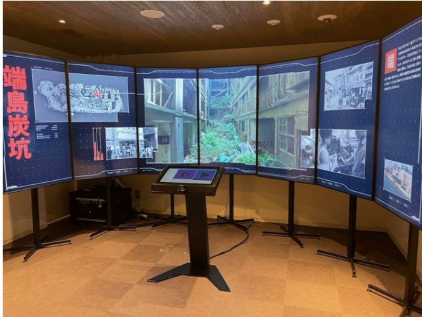
Zone 1. One of two immersive multi-displays (Liquid Galaxy) showing information on each of the 23 component sites.

From UNESCO/ICOMOS July 2021 report, pp. 43.