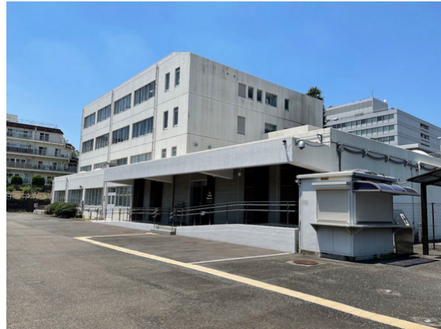
Annex of the Statistics Bureau and entrance to the IHIC. From UNESCO/ICOMOS July 2021 report, pp. 38.

sites, she was free to select and revise historical narratives, denying any memories and other evidence of forced labor that might threaten the image of important stakeholders.