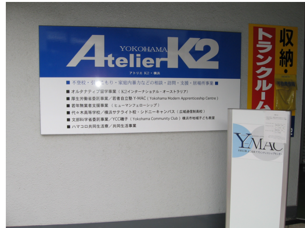
Entrance to K2

another, staff and local community members in a relaxed setting. The number of youth at the center hovers at around 25 and they are supported by a predominantly female staff of ten or so. On average, students are in their mid-twenties, with ages range between 13 and 34. They reside in shared rooms at nearby private houses.