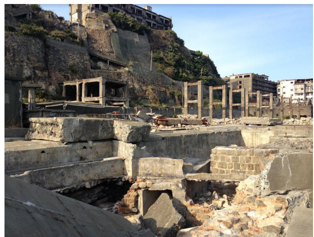
Ruins of the Hashima coalyard and its conveyor belts.