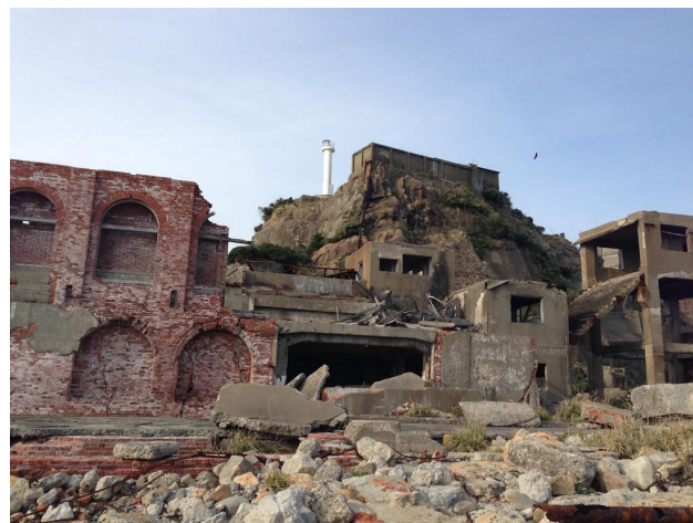
Ruins on Hashima island.