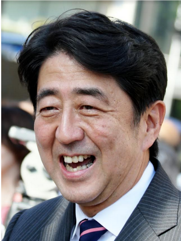
Abe Shinzō.