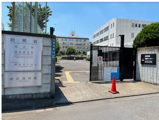
The uninviting entrance to the IHIC accessible through a back road in a residential area in Shinjuku, Tokyo. From UNESCO/ICOMOS July 2021 report, pp. 38.

2 km from Shinjuku Station to the residential area of Wakamatsu-chō makes the IHIC, housed on an uninviting property shared by the Ministry of Internal Affairs and Communications and the government’s National Statistics Centre, an unlikely stop for the serendipitous tourist. A further inconvenience is that the IHIC is closed on weekends. Due to COVID-19 related restrictions, only 30 pre-booked guests may visit each day, and the booking site reveals it is almost never booked full (as of October 2021). 11 As photography is strictly forbidden inside the Centre, 12 its exhibitions and interpretations are hidden from everyone who does not visit in person. 13 The centre is important not because many people will see it, but because it defines the historical narratives of the Meiji Industrial Sites. Especially significant is Hashima Island—the only site popular as a tourist destination. One out of three exhibition zones in the IHIC have “a special focus on Hashima Island during World War II.” 14