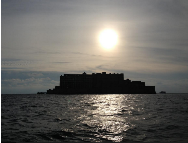
Silhouette of Hashima Island resembling a Battleship.

iconic urban ruins making the island resemble a battleship are from buildings constructed after the end of the Meiji Era, and are thus not recognized as part of the Meiji Industrial Sites. No promotion seeks to draw tourists to see the small, blocked entrance to the Hashima coal mine.