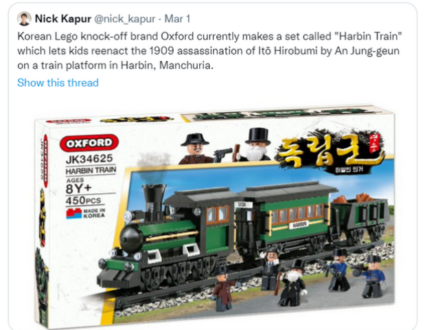
4:10 AM · Mar 2, 2021 · Twitter for iPhone

In the weeks that followed, those who became targets of these right wing circles experienced a wide variety of online harassment as the neto uyo dug through our online media profiles and professional pages ( screencapping and sharing them ), tweeted at our employers and funders calling us racists spreading hate speech, and gleefully declared that anyone who blocked them was no scholar, as we “ran away” instead of engaging in discussion. Some of us received hate mail, some of us death threats. The worst of the harassment was reserved for female researchers, whose credentials were relentlessly questioned, as well as native Japanese scholars, who received comments questioning their ethnicity . Those residing in Japan endured particularly virulent attacks on their personal lives and places of employment.