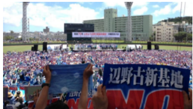
People raising cards saying "Henoko New Base: No" at the rally held at Okinawa Cellular Stadium on May 17, 2015.

Other comments indicate tour participants' solidarity with the "Okinawan struggle."