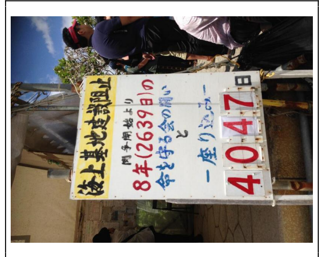
4047 days of sit-in