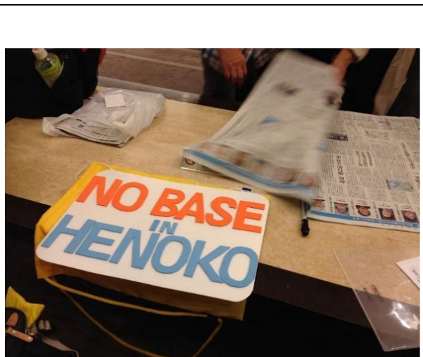
No! As of 2021 the anti-Henoko base

While the tour contributes to the important task of developing a critical gaze on militarized landscapes in Okinawa, the next step should be imagining what the land might look like without the fences that define those spaces. In doing so, the focus may be shifted from depicting “the militarized islands” to questioning what demilitarized islands might actually look like, and what would be required to make that possible. That ultimately will require a restructuring of the US-Japan and multilateral treaties that are the structural underpinnings of the military bases dating back to their origin in land expropriations of 1945 and continuing on, as McCormack indicates, in the structures of American and international power (McCormack, 2019). In doing so, demilitarizing the islands would also mean recognizing the damage done to the land and water, as a wide range of ecological and health damages have been reported (Mitchell, 2013, 2014, 2020).