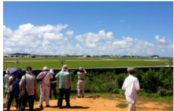
Kadena Air Base during the tour, May 2015.

would be shot while aiming for their heads. The upper body, on the other hand, offers a wider target. And other soldiers would have to care for the wounded, which further reduces their power. In this training range, the soldiers are training for war.” (Interview 2015)