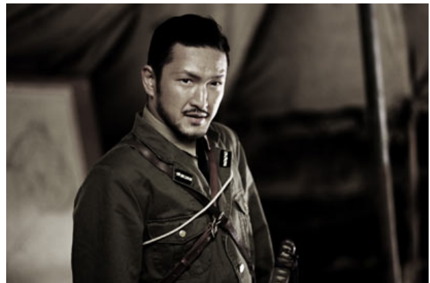
Ito played by Nakamura Shido

And some of the figures are fascinating. Kuribayashi (Watanabe Ken) had studied in the United States, wrote loving letters to his son with comic illustrations, and protected his men against abusive officers; his close associate, Baron Nishi (Ihara Tsuyoshi), was a gold medalist at the Los Angeles Olympics and a friend of Mary Pickford and Douglas Fairbanks. These two are in conflict with more traditional officers like Ito (Nakamura Shido), who seem more concerned with achieving a glorious suicidal death than defending the island and thus delaying the Allied forces’ march on Tokyo. Under Kuribayashi’s unconventional command, a garrison that was supposed to fall in 5 days lasted for 36. (The result was that just 1,083 of Japan’s 22,000 troops from army and navy units survived. The United States suffered the highest casualties of the Pacific War to that time. The 70,000 Marines thrown into the battle suffered 26,000 casualties including 6,821 deaths.)