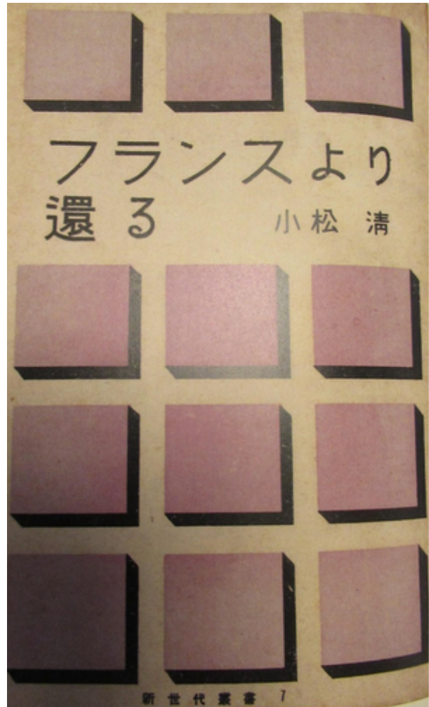
フランスより還る (育生社), Furansu yori kaeru (Return from France), 1941.