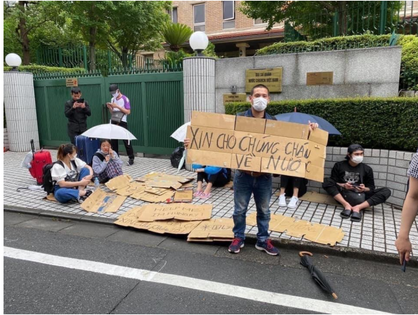
Vietnamese trainees asking for help in front of Vietnamese embassy in Tokyo, Japan.