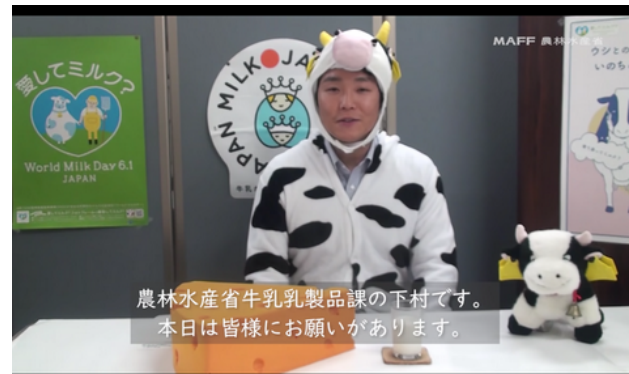
Figure 1: Promotional Campaign

Key words: COVID-19, vulnerable populations, organic farmers, alternative food systems, resilience