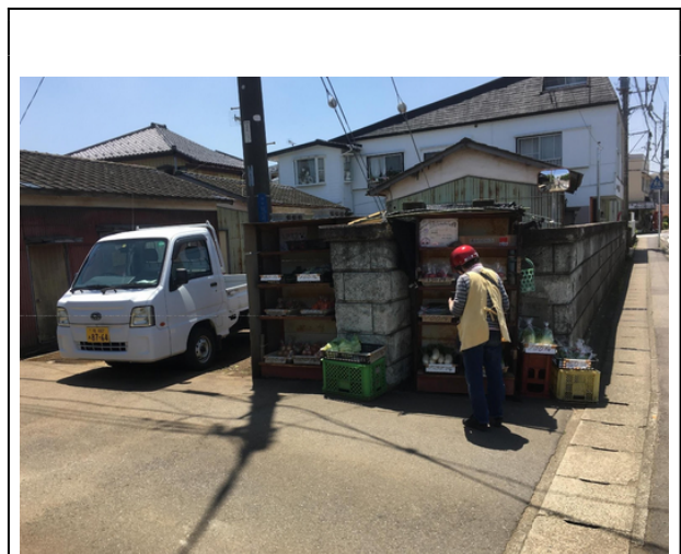
Figure 3: A type of direct sales stand called mujinhanbai in Chiba Prefecture with local consumer. The stand is unstaffed, so customers place their payment into a small box, and the farmer trusts his customers to pay appropriately. Photographed in 2020 by the authors.

For instance, we have spoken with farmers who have seen an increase in their sales at chokubaijyos as more people are cooking at home. One consumer mentioned that much of the produce was sold out by noon so that it was necessary to make it to the markets in the early morning. Seasonality can also explain the increased demand for agricultural products at these direct markets. March and April are often known as a transition period for many small-scale farmers who are busy preparing for the busy summer season.