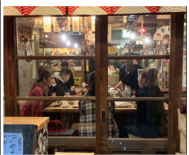
Figure 2: Many local restaurants stayed open during the COVID pandemic, though most closed by 8 pm. (photo by James Farrer April 18, 2020, around 7 pm)