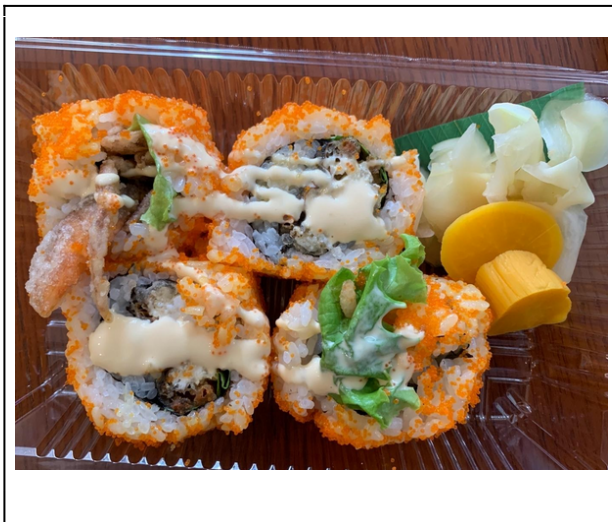
Figure 1: A local sushi bar produced special American-style “spider rolls” (soft shell crab rolls) for its takeout service. They have been a big hit. (photo by James Farrer May 12, 2020)

May, they were able to sell upwards of 70 boxes per day, plus some extra higher-end items such as a fancy 4000 yen box of chirashi sushi that must be pre-ordered. Altogether, they were able to achieve roughly the same sales volume they were planning for with the sushi bar evening service and thus kept their heads above water. It was hard work but rewarding in ways they would not have expected. “We are also getting repeaters now,” the wife said, “and this has been a chance to promote ourselves. Many people thought that if you didn’t have a reservation you couldn’t get in, or first-time customers ( ichigensan ) would be refused.” For the new business owners, it was a chance to establish good relations with the community where they just opened up, and to show potential customers that they are a friendly family business. Their popular inari sushi also used fried tofu skins from a small artisan working right down the street, creating extra business for his tofu shop as well. They also cooperated in their takeout sales with neighboring restaurants, establishing ties they hope to sustain moving forward. Takeout sales ended in late June but sustained the restaurant for two months. The couple planned to re-open for regular business in July, though how they will manage social distancing at an 8-seater sushi bar was still unclear, even to them.