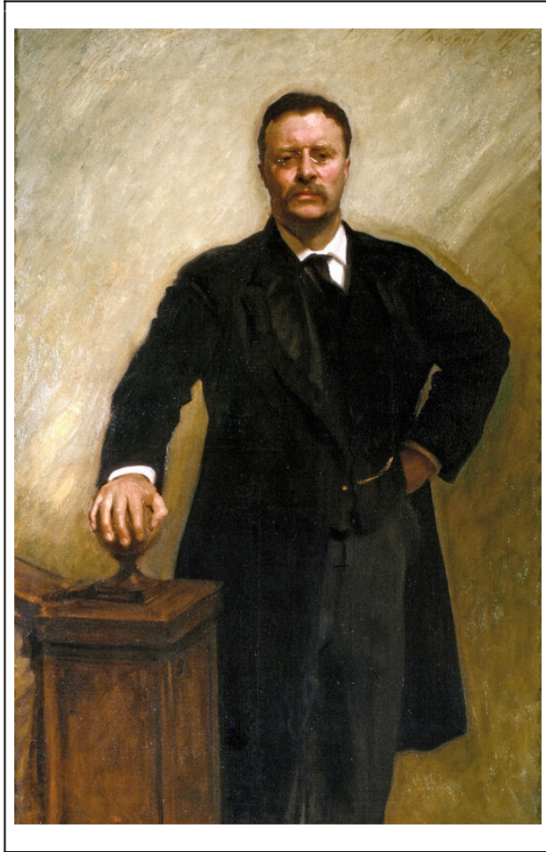
Figure 1: Presidential portrait of Theodore Roosevelt by John Singer Sargent.

Theodore Roosevelt (1858-1919) was deeply upset by the case in San Francisco. His outrage came from a curious blend of geopolitical thinking, antipathy, but also genuine respect for the Japanese people, which in the end, led him to intervene on their behalf. With this, he not only became an active proponent for a racial negotiation zone to accommodate the Japanese people, but he also came, rather oddly, to personify the idea: while he saw “whites” as representing the pinnacle of the racial hierarchy, his pragmatism, fostered by