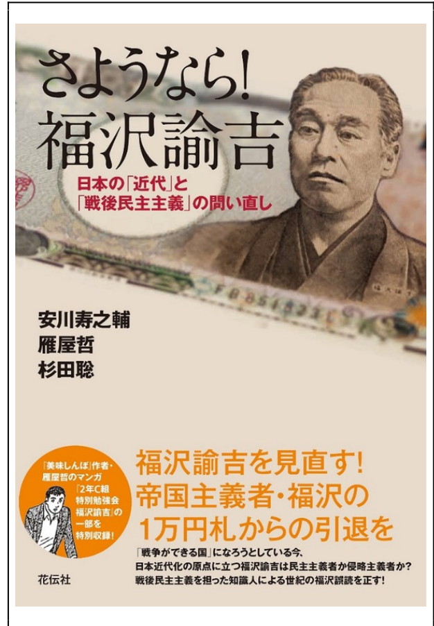
Figure 5: The cover of a 2016 book from the Sayōnara Fukuzawa Yukichi series.