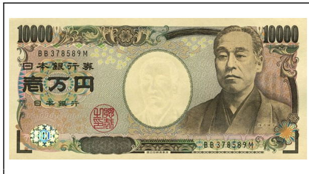
Figure 1: Front side of 10,000 yen banknote with Fukuzawa's portrait, 2004.