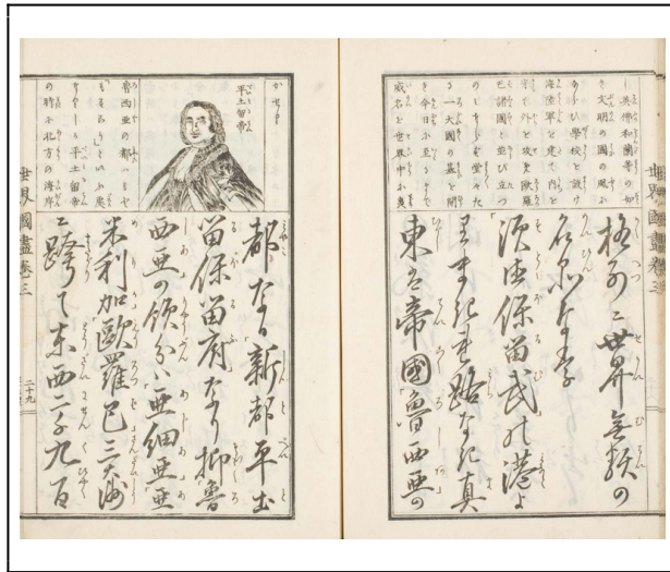
Figure 2: Sekai kunizukushi , vol. 3, folio 29 featuring a portrait of Peter the Great.

This addition highlights the progressive nature of civilization advancement, as I will explain in what follows, and its importance is also reflected in the volume’s structural organization. As a case in point, the order of the countries presented in Sekai kunizukushi ’s “Europe” volume differs significantly from that in MSG. The latter begins with a description of Norway and proceeds through the other countries in a north-to-south order, ending with Turkey. Fukuzawa, however, opens the volume with a section on England and, after traveling in a counterclockwise arc through the Mediterranean region, moves on to Central Europe and Scandinavia, before closing with Russia. In part, this section’s trajectory maintains the textbook’s overall structure previously discussed, serving as the representation of a journey. Following this “route,” Fukuzawa incorporates his