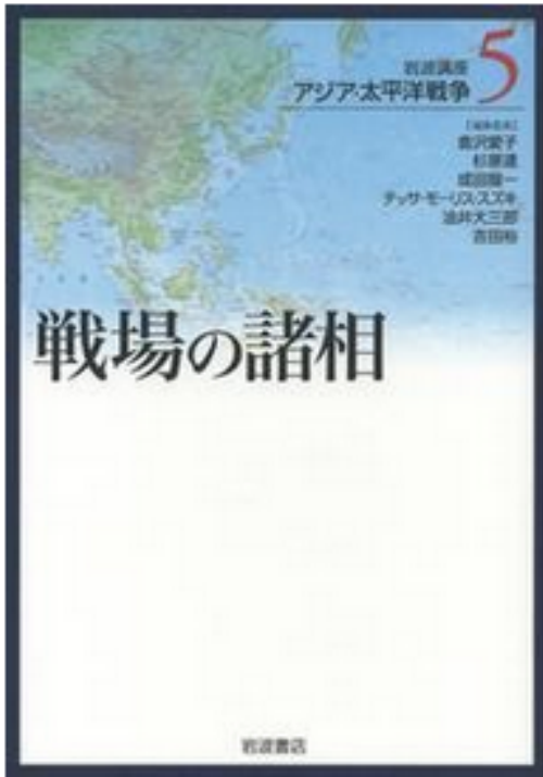
The edited volume containing Yoshida’s article, published by Iwanami Shoten Ajia-Taiheiyō sensō 5: senjō no shosō (2006)