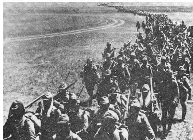
Japanese soldiers on the march, 1939.

on foot, and the primary mode of transportation for artillerymen and machine gun squadrons within infantry regiments was not car but horse. Even the transport corps, which was tasked with supplying food and ammunition, depended largely on transportation by horseback and horse-drawn carriage. When it came to movement and transport, the Japanese Army relied heavily on its foot soldiers and horses.