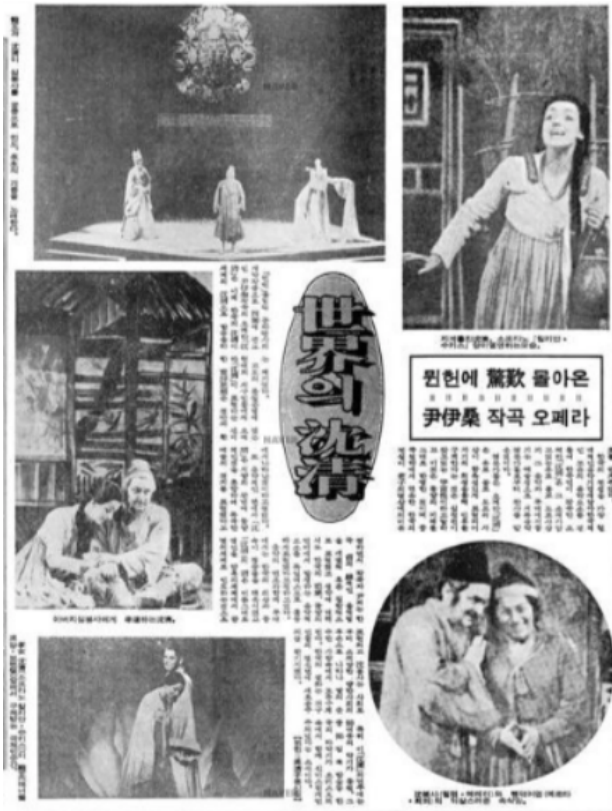
Figure 5: “Simch’ŏng in the World,” Kyŏngnyang Sinmun, August 9, 1972.