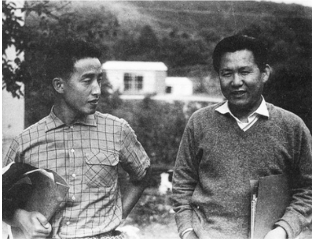
Figure 1: Paik Nam June (left) and Yun Isang in Darmstadt, 1958.

composer Ichiyanagi Toshi, and the Chinese American composer Chou Wen-Chung. 11