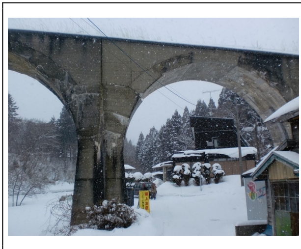
An abandoned railway bridge of the discontinued Ōma railway line constructed