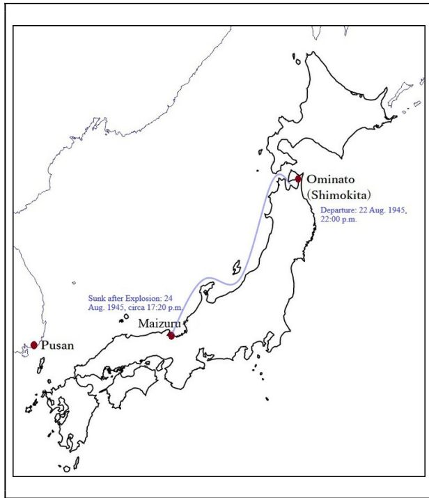
Map showing the sites mentioned in this article and the course of the Ukishima-maru prior to its sinking

rescript on surrender. The voyage was supposed to repatriate thousands of Korean labourers and their families. Many among them had been forced to work on military infrastructure projects across the Shimokita peninsula where they faced harsh conditions in what was a rushed effort to fortify the area in anticipation of the Asia-Pacific War coming to the Japanese main islands. 1