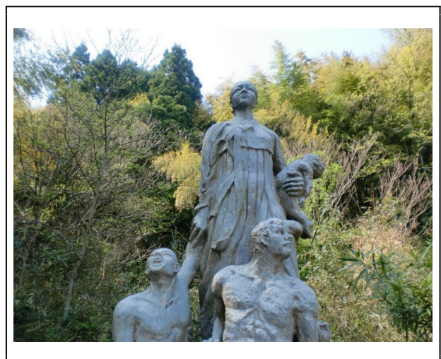
The Memorial to the Victims of the Ukishima-maru Incident (above) at Shimo-Sabaka on the