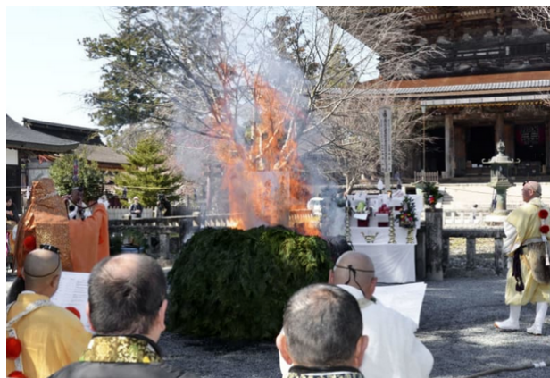
Shugendō ascetics gather on 6 March 2020 at the daikitōe (great prayer assembly) at the temple Kinpusenji to ritually expunge COVID-19.

challenging bodily austerities, secret teachings and initiations, and other distinctive elements for worship at remote mountain sites. Major Shugendō affiliate temples have been responding to the pandemic in ancient ways. For example, the Shingon temple Daigoji in Kyoto on April 15 dedicated the centerpiece of its three-week-long sakurae (cherry blossom assembly), a goma kuyō (fire pūjā ) and performance of kyōgen (comic ritual plays), to eliminating the disease. 31 Another goma kuyō was performed at noon daily at the Shugendō-affiliate temple Kinpusenji in Nara's Yoshino district to drive away the virus. On March 6, fifty shugenja (Shugendō renunciants) gathered at a daikitōe , a "great prayer assembly," a goma kuyō put on jointly by Kinpusenji and the temple Ōminesanji. This was the first ritual collaboration between these sites since they were separated in the Meiji era (1868-1912). 32 The event was broadcast over social media and received hundreds of supportive messages. 33