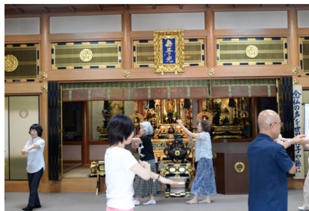
Members of the Rengekai (Lotus Association), the monthly women's meeting at the Jōdo Shinshū temple Tenshinji in Chiba prefecture, practice the obon dance for the summer festival in 2015. Countless local-level gatherings like this are on hold during the coronavirus crisis.

Religion in Japan, as it is elsewhere, tends to be intensely social. For the devout, life consists of frequent in-person meetings. In religious gatherings of all types, believers depend on inspiration from one another. Their sense of self relies on group activities, and the survival of religious groups relies on solidarity their participants cultivate through interpersonal bonds. Prolonged social distancing may exact a toll on Japan's religions. It remains to be seen how isolation will exacerbate differences between internal constituencies and how it will affect parishioners' desire to return to regular participation.