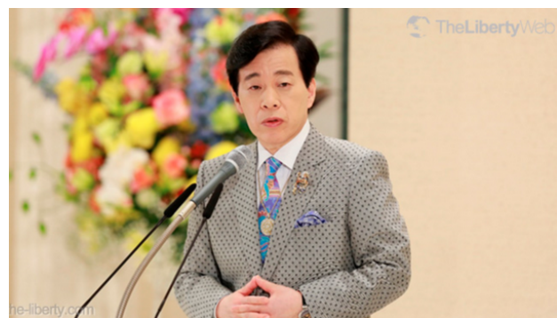
Happy Science founder Ōkawa Ryūhō addresses followers in Sendai on 14 March 2020.

Cantare, along with other beings, Ōkawa highlighted messages he received about coronavirus as an existential threat to Japan. 19 Happy Science caught media attention for defiantly gathering large numbers of members just as other New Religions closed down; Ōkawa addressed approximately 1300 followers and guests in Kagawa prefecture on February 22 and 1200 in Miyagi prefecture on March 14. In his speeches and in the religion's publications, the spiritual leader advanced Happy Science's rightwing Japanese political agenda as it advertised his signature ritual practice as the most effective means of eliminating the disease. 20 "This infection is made in China," Ōkawa announced. "To combat a godless communist dictatorship that is spreading sorcery across the world to oppress human rights and exert its hegemony, I am thinking of a divine protection. Services at our branches and Viharas ( shōja ) focus primarily on watching and listening to videos of dharma talks and praying. We are not curtailing these services, but we are taking sufficient precautions by using alcohol-based disinfectant and monitoring health conditions." 21