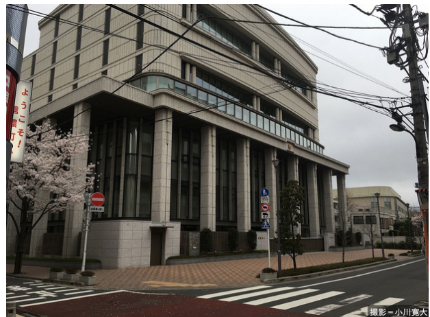
Streets around Soka Gakkai’s Hall of the Great Vow of Kōsen Rufu remain empty after it closes its headquarters in Shinanomachi, Tokyo.