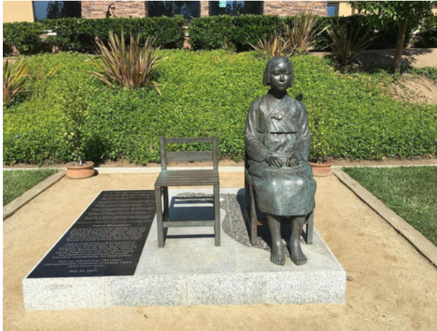
The Statue of Peace in Glendale Central Park, Glendale, CA.