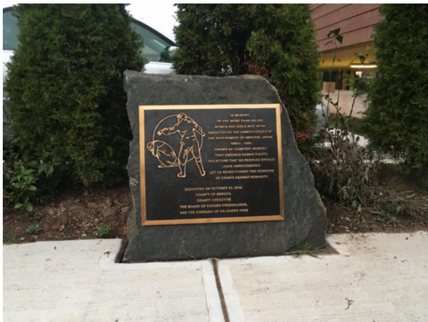
Palisades Park Memorial.

In 2010, the first “comfort woman” memorial was built in the United States, next to a public library in Palisades Park, New Jersey. More than half the residents of the city are of Korean ancestry. 17