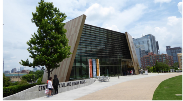
National Center for Civil and Human Rights in Atlanta, the originally proposed location for the Statue of Peace.

The original plan by the local activist group, Atlanta Comfort Women Memorial Task Force, however, was to have the statue at the National Center for Civil and Human Rights in Atlanta, a major tourist destination. Yet three weeks after the agreement to place the statue there, the Center withdrew from it, and local media reported that the Japanese consul general of Atlanta had met with local business leaders, officials of the Center, and other influential people, “to express concerns and threaten Japanese business fall-out from erecting this memorial,” the same tactic that the Japanese government used in Southfield, Michigan and elsewhere. The Center withdrew from the agreement, and instead, the Task Force succeeded in persuading the City of Brookhaven to accept the donation of the statue. Attempts by the Japanese consulate to block the acceptance and installation of the statue in Brookhaven failed.