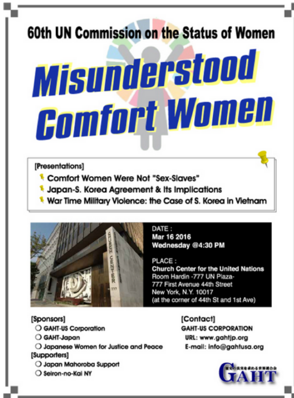
Flyer for the “Misunderstood Comfort Women” session co-sponsored by GAHT and Nadeshiko Action (Japanese Women for Justice and Peace) held during the 60th UN Commission on the Status of Women, New York City, March 16, 2016. Source