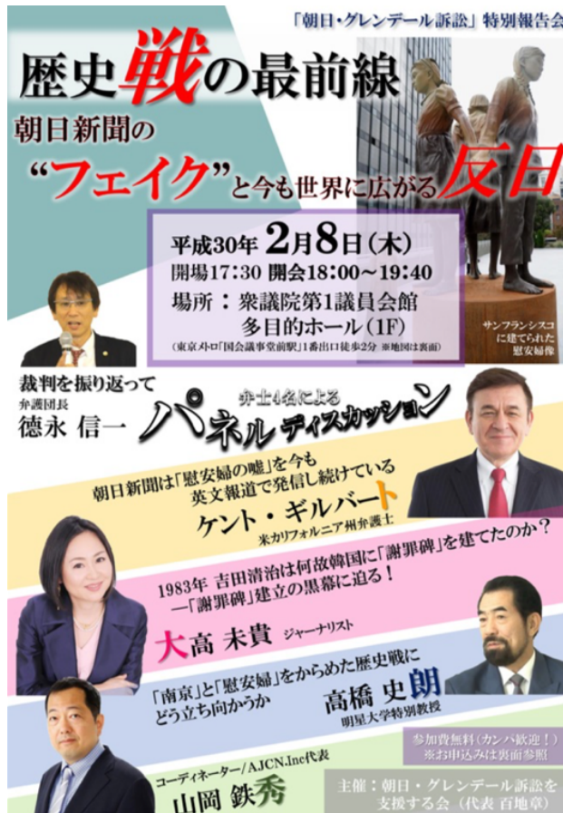
A flyer for a rally reporting on the Asahi-Glendale Lawsuit, “The Front Line in the History Wars: The ‘Fake’ News of the Asahi and the Anti-Japan Movement Spreading to the World”, held in Tokyo in Feb 8, 2018.