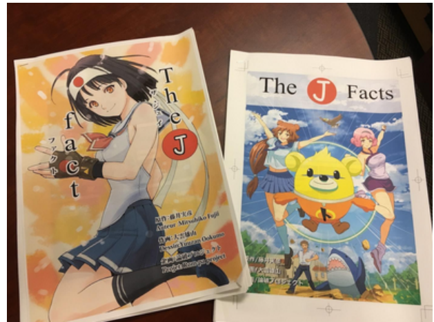
The J fact and The J Facts manga by Rompa Project, received by the City of Buena Park. The yellow-colored animal character is Tokkuma-kun, a mascot of the Happiness Realization Party.