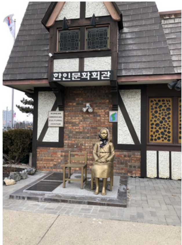
The Statue of Peace in front of the Korean American Cultural Center in Southfield MI.

struggles. One such example is Southfield Michigan, a suburb of Detroit, where local Korean-American citizens formed the “Comfort Women Peace Statue Project” in 2012, and began working toward building the first-ever Statue of Peace in the U.S. at the Southfield City Library. The design was based on the Statue of Peace in Seoul. Those involved in the project told me how difficult it was to find a public location to build the statue, due to the consistent interference by the Consulate General of Japan in Detroit, as well as by Japanese corporations, most notably Densō, a major auto parts manufacturer with its North American headquarters in Southfield. 23 After an almost-successful deal with the Southfield library failed in 2013, the group reached out to a number of possible locations - cities in the Metro Detroit area, public universities and museums. All attempts to build in a public location, however, ended in failure. According to Korean Americans involved in the project, the auto industry is extremely important in the region, and people feared undermining the relationship with the Japanese auto industry. After a few years of struggle, they gave up on building the statue in a public location, and in 2014 they placed it in front of their own facility, the Korean American Cultural Center.