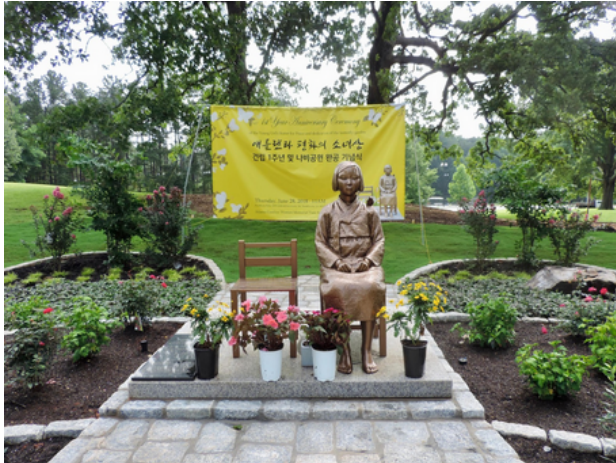
The Statue of Peace in Blackburn Park of Brookhaven, GA.

The original plan by the local activist group, Atlanta Comfort Women Memorial Task Force, however, was to have the statue at the National Center for Civil and Human Rights in Atlanta, a major tourist destination. Yet three weeks after the agreement to place the statue there, the Center withdrew from it, and local media reported that the Japanese consul general of Atlanta had met with local business leaders, officials of the Center, and other influential people, “to express concerns and threaten Japanese business fall-out from erecting this memorial,” the same tactic that the Japanese government used in Southfield, Michigan and elsewhere. The Center withdrew from the agreement, and instead, the Task Force succeeded in persuading the City of Brookhaven to accept the donation of the statue. Attempts by the Japanese consulate to block the acceptance and installation of the statue in Brookhaven failed.