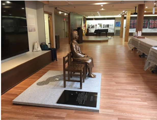
The Statue of Peace at the Museum of Korean American Heritage in Manhattan.

Peace was erected at the Museum of Korean American Heritage in Manhattan, New York, the Sankei Newspaper of Japan reported that the Japanese consulate pressured local politicians not to attend the unveiling event. 40