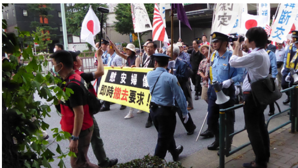
An ACM march in Ginza, Tokyo, on June 19, 2016, demanded the removal of the Statue of Peace in Seoul. The march, organized by ‘Nikkan Dankō Kyōtō I’inkai, Teito’ (The Joint Struggle Committee to Break Diplomatic Relations Between Japan and South Korea), was entitled “Demonstration to Demand the Removal of the ‘Prostitute’s Statue’ in front of the Japanese Embassy in Seoul.”

It was from the date of the completion of the statue that the Japanese right-wing started to engage in activism against “comfort woman” statues, as seen in this march by an ACM group held in 2016, demanding the immediate removal of the “comfort woman” statues, in Seoul and elsewhere.