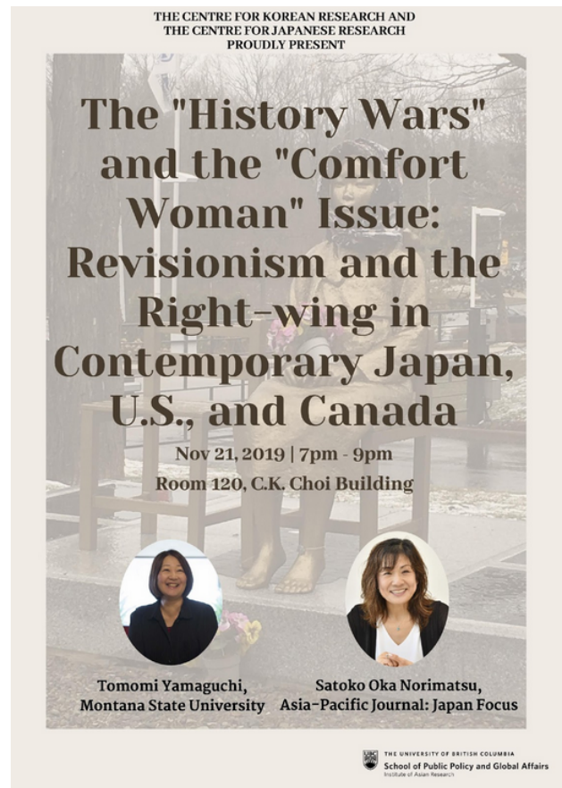
Event poster by the Centre for Korean Research and the Centre for Japanese Research, University of British Columbia