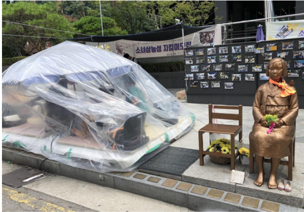
Statue of Peace in front of the Embassy of Japan, Seoul.

It was from the date of the completion of the statue that the Japanese right-wing started to engage in activism against “comfort woman” statues, as seen in this march by an ACM group held in 2016, demanding the immediate removal of the “comfort woman” statues, in Seoul and elsewhere.