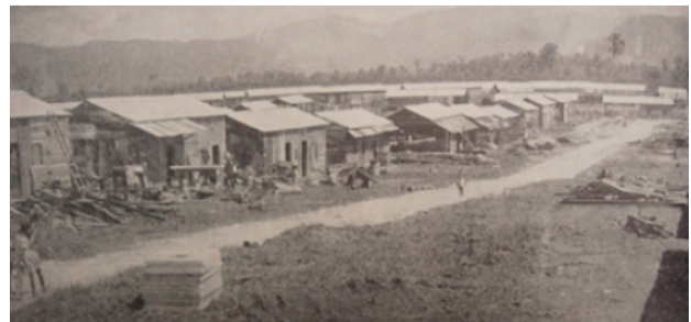
Jinjang New Village, Malaya, 1950s.

attack British colonialism in Malaya and to prevent eventual independence from total domination by the Malaya majority. After approximately two years of violent but ineffective attempts to put down the insurgency, the British adopted clear, hold, protect, and persuade strategy aimed directly at the Chinese population who were removed to fortified "New Villages" where British managers of the British Empire in Malaya and their Malay cohort subjected them to political proselytization, self-policing, and reward for compliance with some of the social and economic goods of modernity, especially schools, health care, safety, and support for small business. 40 By 1958, more than 763,000 Chinese-Malayans (12 percent of the total Malaya population) lived in 582 fortified and heavily controlled protection villages. 41 The program was devised by General Sir Harold Briggs and implemented by General Gerald Templer.