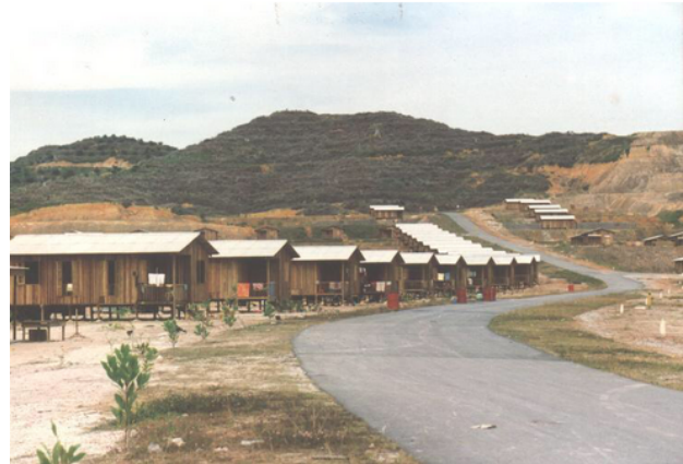
A FELDA resettlement village, Pahang, Malaysia 1970s

After merdeka in 1957 and final creation of Malaysia (without Singapore) in 1959, the Malay managers of the new state also thought so highly of the New Village program that they recreated elements of it as a way of regulating Malaysia and making it more legible as a modern state. Until its conversion into a state manager of agribusiness in 1991, the Federal Land Development Authority (FELDA) created, administered and managed a vast relocation and resettlement scheme in peninsular Malaysia.