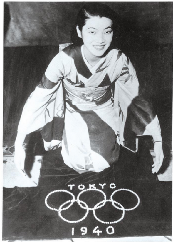
Model poses with strings of pearls arrayed in the Olympic logo.

At the closing ceremonies of the 11th Olympiad in Berlin --- memorialized in Leni Riefenstahl's film "Olympia" --- IOC President Latour announced to the crowd, "It has been decided that the next Olympics, in 1940, will be held in Tokyo."