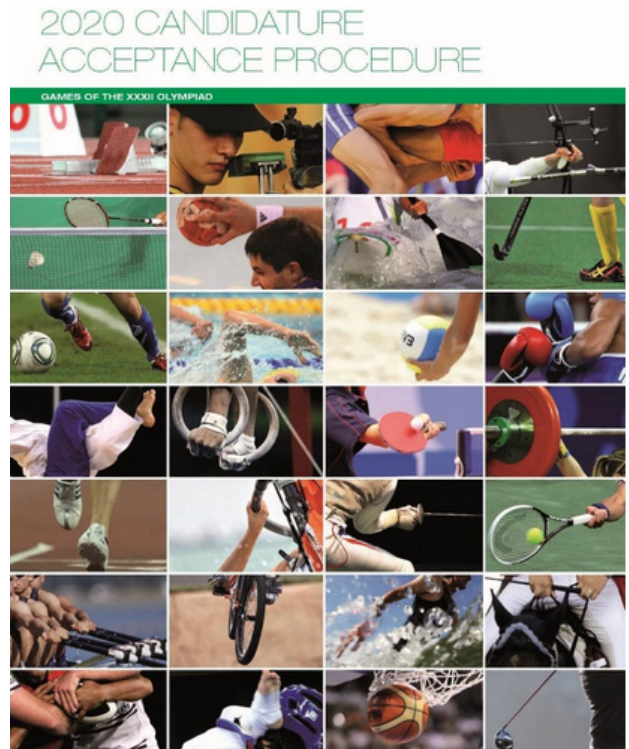
IOC Guidelines for Candidate City Application

Games itself, during which the host city and its country undertake massive and intensive infrastructure construction, broadcasting and other commercial rights and forms are negotiated, an aesthetic design thematic of the Games is created and promoted in multiple media and products, Olympic educational programs are launched, and so on.