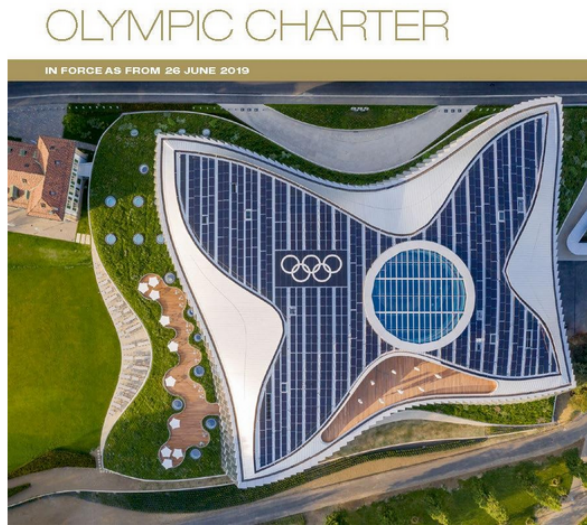
Olympic Charter, 2019

An Olympic flame, presiding over the central stadium was introduced for the 1928 Amsterdam Games, and as part of his grandiose scheme for the 1936 Berlin Olympics, Hitler persuaded the IOC to authorize an extension of this ritual. A torch was lit by the sun’s rays on Mount Olympus, and a relay of “sacred runners” carrier the torch all the way up to Berlin to light the stadium flame. There was a steady accretion of ceremony. An Olympic anthem was written, athletes took an Olympic oath, an Olympic creed reinforced the motto, medal award ceremonies featured olive branch crowns, national flags and anthems, and the medallions themselves, and posters and emblems were designed by the host city