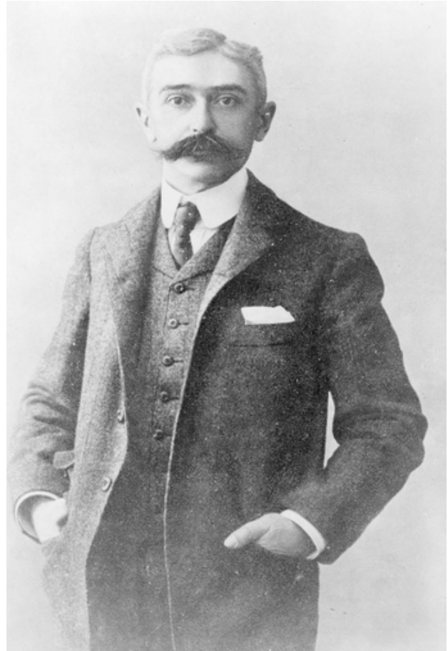
Baron Pierre de Coubertin, founder of the modern Olympic Movement

It was far from certain in its early days that the IOC would survive let alone grow to such dominance. The inaugural Games it staged in Athens in 1896 drew 245 male amateur athletes, overseen by 15 members of the IOC. The games that followed (1900 Paris, 1904 St. Louis, and 1908 London) were held in conjunction with and not infrequently lost within international expositions. The 1912 Games in Stockholm (at which Japan debuted as the first Asian nation) were held on their own, but the IOC was concerned that host cities were gaining too much latitude in running the Games, picking the sports, and choreographing the contests, so it moved to assume direct control over all elements of the Games, powers that it was never to relinquish. De Coubertin used his hand-picked committee to contain the leading international sports federations, especially the International Amateur Athletics Federation, and then, in the 1920s, his IOC co-opted or strangled several rival Games, especially the upstart Women's Games and the Worker Games. 2