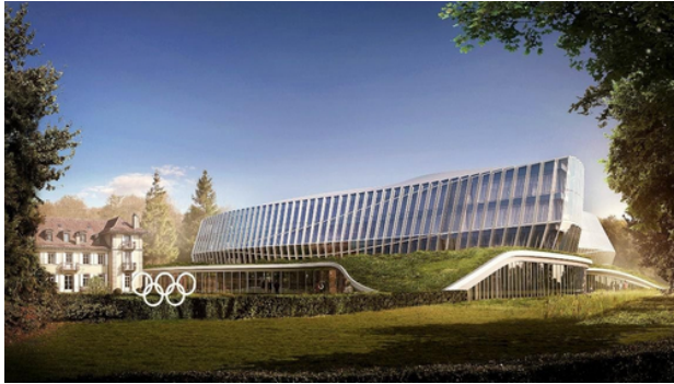
New headquarters of the IOC that opened in 2019 in Lausanne, Switzerland, adjacent to the villa (at left) that had long housed its offices.

governmental organizations, the IOC in coordinating the Olympic Movement has extraordinary reach, unusual powers, and a deep history.