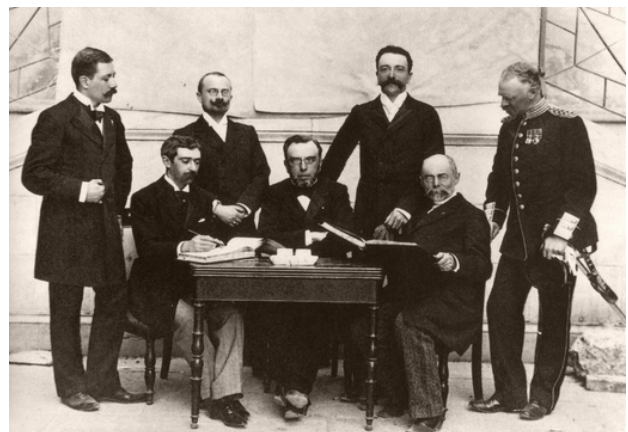
Meeting of the IOC at the inaugural 1896 Athens Olympics (Coubertin is second from the left).