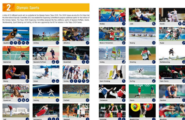
The 33 sports at the 2020 Summer Games

The sports that appear in the Olympic Games have grown in number over its history and there have been some replacements, although there has been surprisingly little change in recent decades. For the 2020 Summer Games, baseball/softball returns (after being dropped from the 2012 Games) and for the first time, skateboarding, surfing, karate, and sports climbing have been added, presumably to enhance the Games' appeal to younger viewers. 5