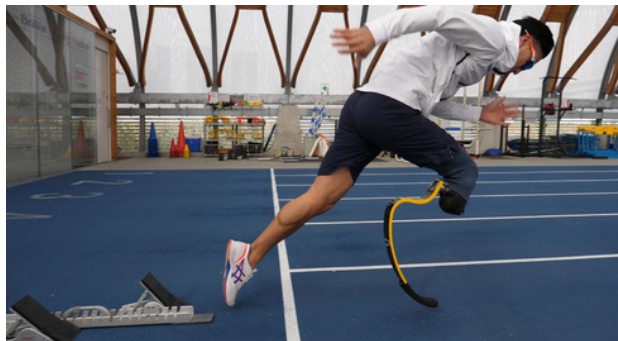
Paralympic sprinter Itani Shunsuke in training.

between ability and “disability.” In furthering its goals of diversity and inclusiveness, it is bringing the Olympics ever closer to the Paralympics, in scheduling and venues and events, but also in requiring its sponsors now to commit to advertising in both and to equally display the two Games logos. This close juxtaposition raises questions about whether there really are clear lines between the two categories of athletes. Is the high-tech prosthesis that Japanese Paralympic sprinter Itani Shunsuke wears really different from the new Nike Vaporfly running shoe that is propelling Olympic marathoners to record times? Indeed, as with greater integration of male/female events, by the logic of the Olympism itself, we can readily conceive of a closer integration of the Olympics/Paralympics with coordinate events (much as wheel-chair athletes compete side-by-side with other runners at the Boston Marathon) and even events structured to allow equitable competition among all bodies.