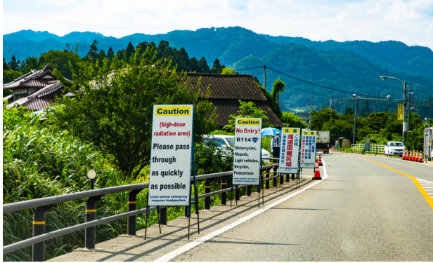
Caution signs include prohibiting pedestrians, August 2019

Olympians and their supporters will run right through these areas, with international television cameras beaming scenes of cheering spectators and pretty countryside around the world. At the same time, recognizing