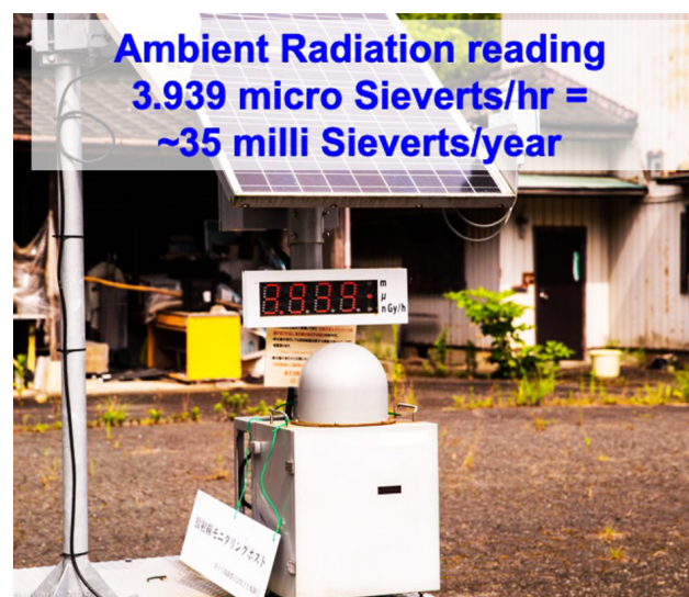
Near the town of Namie, August 2019

In December 2019, the international environmental group Greenpeace publicized studies of areas along the planned Olympic torch route displaying high levels of radiation. International efforts to discredit Greenpeace and its science as “leftist” work for popular consumption, yet what about the Japanese government’s own measurements? During two day-long trips in August 2019 to publicly accessible sites along the planned Olympic torch route, government installed devices revealed levels of radiation numerous times higher than is safe for human habitation as was acknowledged in several road-side signs in Japanese and English.