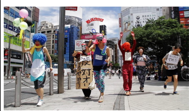
“Han-ran” running event in Shinjuku on July 2013.

The group continued this style of comic and inventive protest action with two fake sports events. Held in July 2013, the first was the “Han-ran” (a pun on hanran , meaning rebellion, but also meant as “anti-run,” specifically mocking the 2020 organizers’ “day runs”), which saw participants in colorful costumes festooned with anti-2020 paraphernalia, running in the pedestrianized zone in Shinjuku as a tongue-in-cheek version of a race. One runner was dressed as Adolf Hitler, in an apparent nod to the 1936 Berlin Games.