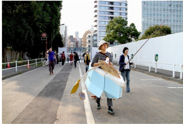
The “Han-Orinpikku Ran-ran-ran” parodic sports festival around the New National Stadium and Meiji Park area on October 12, 2015.

action seemed to encapsulate the casual equilibrium of declamatory and ludic.