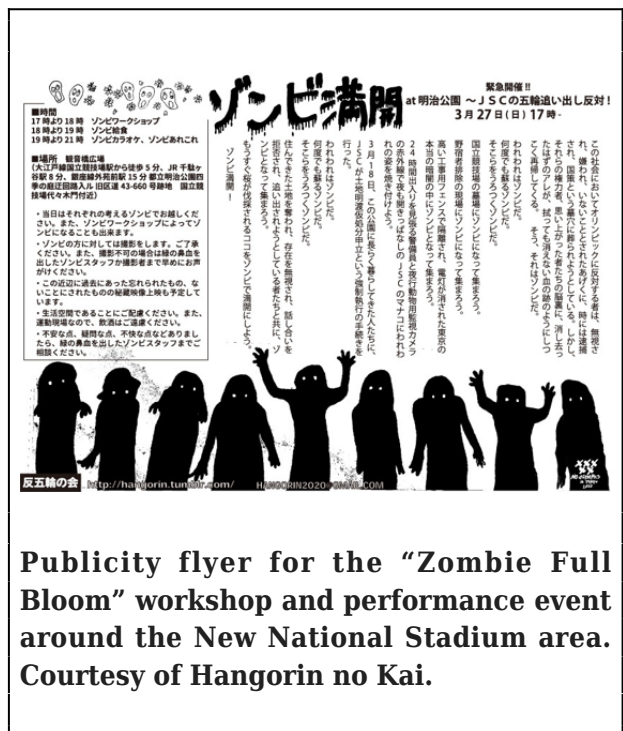
Publicity flyer for the “Zombie Full Bloom” workshop and performance event around the New National Stadium area.

Some of the group’s stunts are less visible or provocative, instead veering off into the surreal. On March 27, 2016, Hangorin no Kai’s activists transformed into zombies. Starting again as a workshop in the late afternoon, the participants dressed up in DIY ghoulish costumes and makeup to stage an undead protest walk around the site of Meiji Park (by now, partially closed) during the night. It was as if the recently evicted residents were returning from the dead to haunt their former home. The participants mobbed the fenced-off park, banging on the gates like zombies trying to get in. The whole event was filmed and edited into a parody horror film, and uploaded online. 6