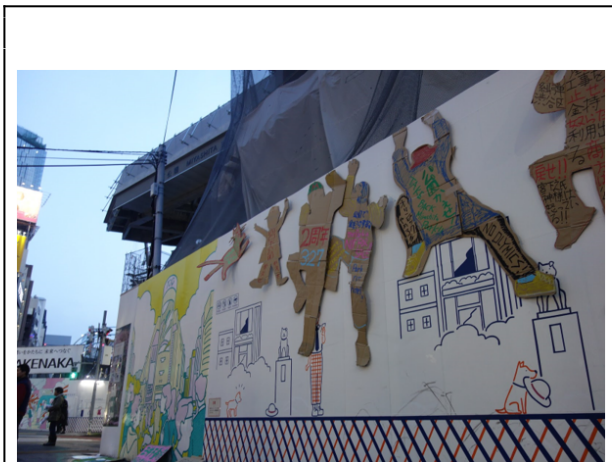
The Miyashita Park construction site hoarding was again “hijacked” in March 2019 with cardboard figures with anti-Olympics slogans.

shopping complex. Miyashita Park was another example, at one point its fencing decorated with a mural called “A day in the life [of] Shibuya” that presented Shibuya’s image of itself as a diverse and liberal place through a young girl’s encounters with the ward’s citizens (including a male same-sex couple, people with disabilities, and the elderly). It is a showcase of diversity but a very bourgeois one that has no room for the homeless or certain marginalized groups. In March 2019, activists from Miyashita Kōen Neru Kaigi protested the closure of the park and the coopting of the fencing to legitimize the gentrification in Shibuya by attaching their own cardboard figures decorated with messages. At a glance, these figures seemed to be climbing up the hoarding as if trying to get back inside the park. This tactic of adding cardboard art objects to fencing has been employed regularly by activists to protest park closures at night, not only Miyashita Park.