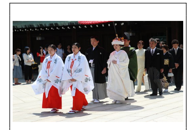
Figure 3. Traditional Japanese wedding. Source here.

Jones et al 2017: Kopelman et al. 2009; Lockwood, Burton & Boersma 2011; Valetas 2001). Yet Japanese women who marry are under additional pressure to relinquish their surnames. Despite the gender-equal Civil Code Article 750, the single surname requirement for the koseki registration, together with the lingering social norms of ie , resulted in women adopting their husband's surnames in 96 percent of marriages, reinforcing patrilineal legacy and social expectations (Ministry of Health, Labor and Welfare, 2016; Toyoda & Chapman, 2017).