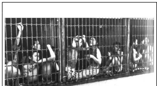
Children caught and detained through

There was another "problem" with this figure of 123, 511: children of broken and/or impoverished families, whose parents were alive, may have been included in the number "by mistake," largely because they were on the street just like sensō koji . They were called furōji [juvenile vagrants]. For the postwar government, it was essential to separate furōji from sensō koji , because the former were suspected of disturbing public peace and social order. The editorial of the journal Shakai Jigyō [Social Work] published in 1946 insisted that most furōji (浮浪児) had already become furyōji (不良児), that is, "juvenile delinquents." In the same journal published in 1948, Takeda Toshio, a social worker, wrote, "Even though we call them sensō koji , more than 40 percent of them have already become furōji (1948: 1). These reports created what I call sensō koji-cum-furōji . They were "hunted, rounded up and captured" ( karikomi ) by the police, and sent to shelters, prisons or relatives (if any were willing to accept the child). 11 However, many quickly ran away from those facilities, and returned to what Yoshioka Genji later called "the land of freedom," the places they inhabited before being captured (1987). The reports indicated that sensō koji-cum-furōji committed such crimes as theft, pilferage, embezzlement, arson, black-market trading, gambling, prostitution and consuming and selling illegal drugs. 12