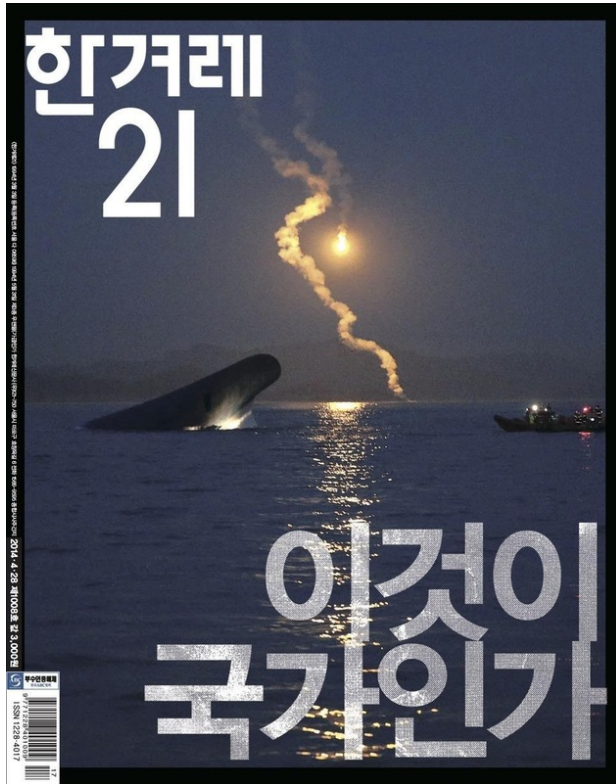
Hankyoreh 21 cover headline: "Is This a Nation?"