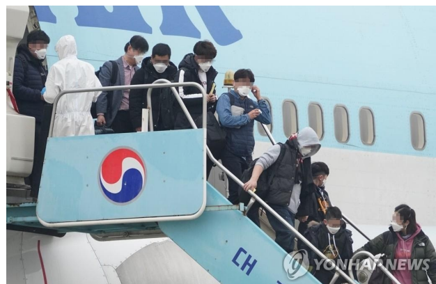
Korean nationals from Wuhan arrive at Incheon International Airport via charter flight.

I believe that the lessons learned from the Park administration’s failure drove the response by the Moon administration. At each key juncture of the pandemic’s progression, the Moon administration endeavored to instill in the public the sense that the government was doing everything it could possibly do to protect them and was attuned to their needs during the pandemic. In particular, three key moments stand out: (1) the effort to bring Koreans home from the affected areas, including Wuhan, China; (2) the all-out push in the Daegu Shincheonji outbreak, and; (3) second-order relief programs such as mask distribution and online schooling, as well as holding the national election for South Korea’s legislature. The public trust earned through these actions helped not only with the public’s response to the pandemic, but also with the Moon administration’s political fortune.