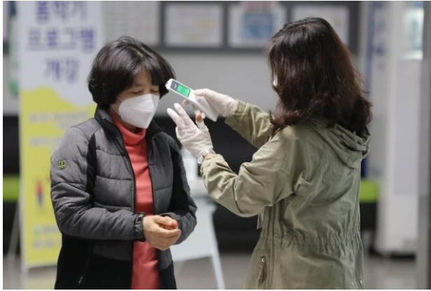
Voter in Gwangju receives a temperature check prior to entering the polling site.

Next came the National Assembly elections on April 15, in which South Korea elected the members for its unicameral legislature. It was a particularly important election, as throughout Moon Jae-in's term until that point, his administration could not enact its legislative agenda as their Democratic Party had the plurality but not majority in the legislature, with 123 seats out of 300. With two years remaining in Moon's single five-year term, the Assembly elections practically served as a midterm election that would either provide a renewed boost for Moon's political mandate or turn the president into an early lame duck. The logistics of having millions of voters cast their ballot amid the pandemic was a daunting problem. As late as one month before the elections, some politicians called for the elections to be postponed (Lee, M. 2020)