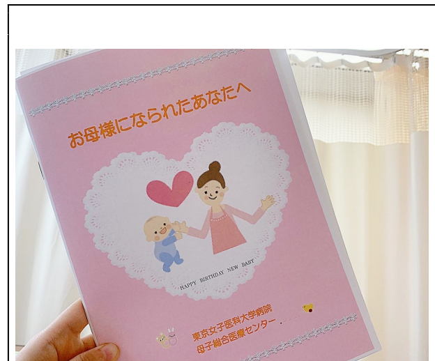
The booklet I received at the hospital after my baby was born. New moms have to bring the booklet to the classes with them at the hospital.

Before mid-March, life was still quite normal in Tokyo other than masks and toilet paper being sold out everywhere. In the final weeks of my pregnancy, I was still out everyday, going to restaurants, the gym, and the hospital for checkups. Things only started to change a