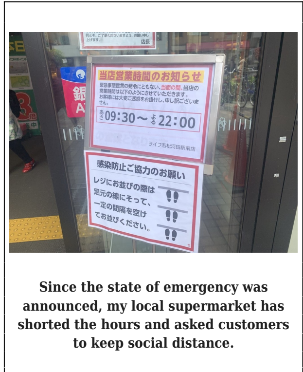
Since the state of emergency was announced, my local supermarket has shortened the hours and asked customers to keep social distance.

sure when we will be able to see each other, as the situation continues to be unpredictable and no one knows at what point we can really say that the crisis has ended.