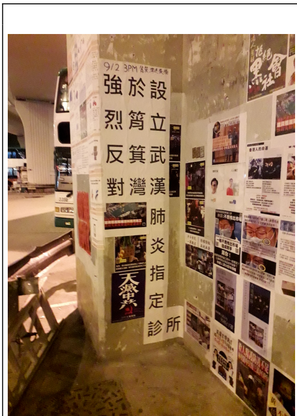
Poster opposing the establishment of a Covid-19 clinic in Hong Kong island’s Shau Kei Wan district.

Since late January, the Hong Kong Police Force, citing coronavirus restrictions, has not given permission for any marches or rallies. When protests have occurred, attendance has been low compared with similar events last year.