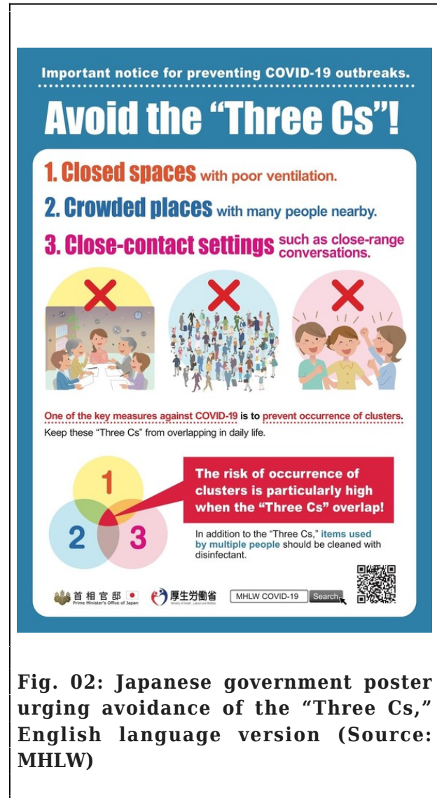
Fig. 02: Japanese government poster urging avoidance of the “Three Cs,” English language version

understand manner.” The Prime Minister and others echoed similar talking points. It amounted to a politically motivated victory lap, and was likely premature.