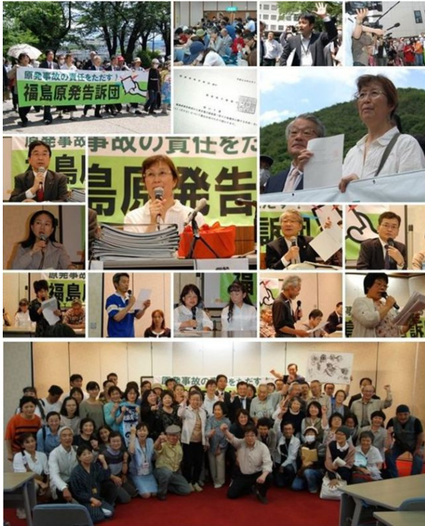
Photos from June 11, 2012, when 1324 residents of Fukushima filed a criminal complaint against 33 TEPCO executives and government officials.

Ultimately, three of them would be indicted, after citizens on two Prosecution Review Commissions overruled the non-charge decisions of Japan’s professional prosecutors.