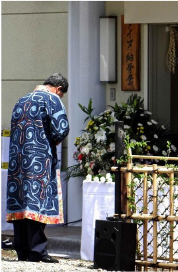
Ceremony commemorating almost 1000 Ainu people whose remains are held by Hokkaido University, 2013

presence of the Memorial Facility in the Upopoy Ainu Museum and Park complex receives no mention at all in the official publicity brochure on the park that has been prepared for foreign visitors). A number of Ainu groups have been campaigning for years for these remains to be returned to the areas from which they were excavated, and as a result of court cases brought by these groups, the remains of about one hundred people have so far been returned to their communities.