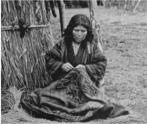
The production of richly appliquéd and embroidered robes is one of the hallmarks of Ainu material culture, past and present (Early 20th century photo, location and photographer unknown)

Long contact with Japan to the south meant that there was considerable intermarriage, and during the eighteenth century, the Japanese Domain of Matsumae, and later also the Japanese Shogunate, exerted growing economic control over Ainu fishing and trading activities. It was only after the Meiji Restoration of 1868, though, that most of the land of the Ainu was incorporated into Japanese territory, and that Hokkaido was given its present name and became a magnet for the migration of Japanese settlers. Ainu lands were seized by the Japanese state and turned into farmland, traditional Ainu hunting and fishing practices were prohibited, and Ainu children were subject to assimilationist education. An 1899 ‘Former Natives Protection Law’ attempted to impose assimilation throughout Ainu society, in practice resulting in the impoverishment and marginalization of many Ainu people (Kayano 1994; Siddle 1996). This