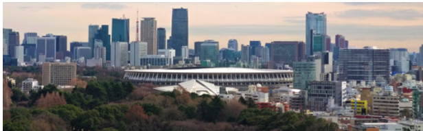
Kuma Kengo's Olympic Stadium nestles into its urban setting in downtown Tokyo. Photo: Peter Matanle, 16 January 2020.

Is there a clearer expression of the consciousness of modernity – its urge towards improvement, progress, and the individual self – than the Olympic Games? Modernity, modernism, and modernization are infused into every aspect of the Games, from the spectacular stadia, through dazzling ceremonies, to sensational athletic achievements. Amid the tendency to be analytical, and perhaps critical, let's first not forget that the Olympic Games is an immense source of inspiration, delight, entertainment, peace, idealism, and sheer unadulterated joy for millions of people around the world. And don't we all need some joy in our lives from time to time?