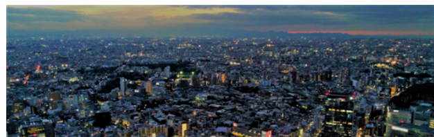
Tokyo as Global Field. 16 January 2020.

More than anything associated with modernity and modernization, the Olympic Games is a celebration and invocation of the modern global city. No longer walled and arranged around a castle for collective defence, and so much more than a market for economic exchange, the city has become the fountainhead for the expression of identity and fulfillment of creative impulses, a space for coming together and