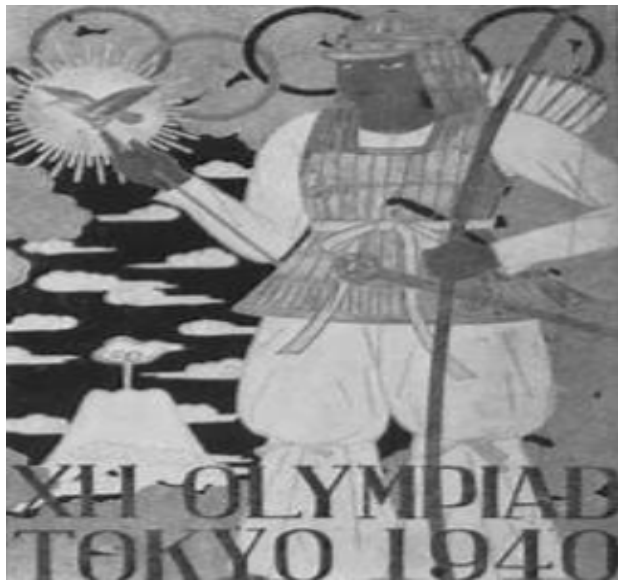
Contest winner Poster featuring mythical Emperor Jimmu

Adjacent to the new national stadium, the Japan Olympic Museum is shaped to resemble an Olympic torch. It has two floors of displays, videos and interactive features that attracts throngs on weekends and holidays. The large sculpture of five Olympic rings in front of the gleaming glass walled tower is a popular photo spot. Inside there are historical dioramas about the origins and evolution of the games, displays of logos from previous games and an interesting section on the 1940 Olympics. There is no reference to the controversy over the 1940 poster and there is almost no information about Tokyo's decision to forfeit the games in 1938. After winning the bid in 1936, there was a public poster competition. The winning entry depicted the mythical Emperor Jimmu, said to be the first emperor, and creator of Japan, whose 2,600th anniversary was being celebrated in 1940.