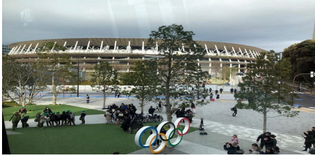
New Olympic Stadium