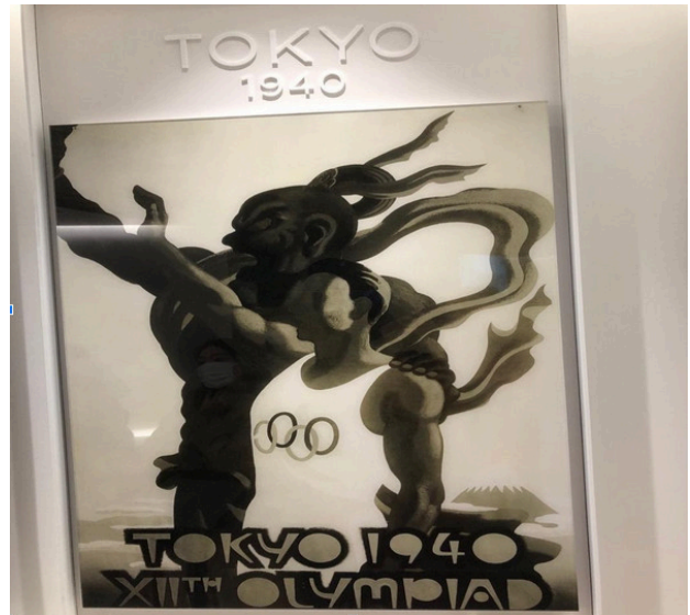
Temple guardian Niō (仁王) has a menacing look.

athlete, right arm thrusting to the heavens, superimposed on the fearsome temple guardian Niō (仁王) whose left-hand rests on the man's shoulder. Niō is well known to Japanese as the temple gatekeeper who wards off evil spirits. Perhaps representing Jimmu was seen to diminish his imagined grandeur.