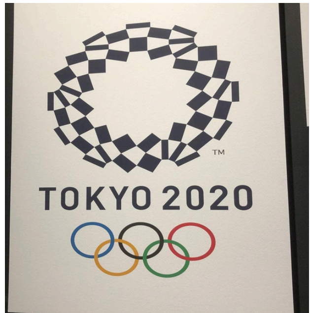
The Olympic logo that replaced the plagiarized design.

On left the design judged to closely copy the logo of a Belgian theater group.