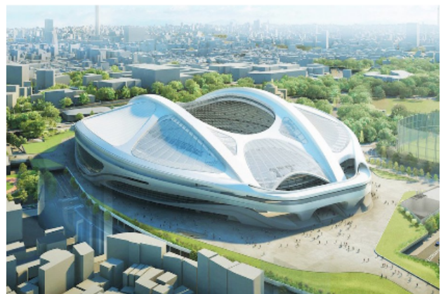
Zaha Hadid's Olympic Stadium Design

Partly this was due to massive cost overruns, with the price-tag soaring to US$2 bn, double initial estimates, but also on aesthetic grounds since it was a vulgar eyesore widely likened to a toilet seat.