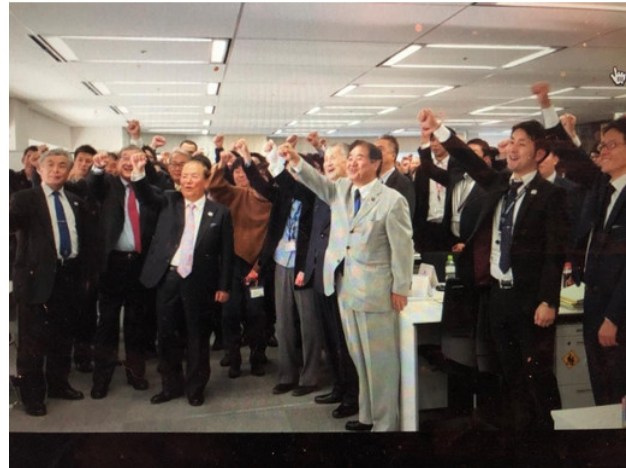
Team Tokyo 2020 Celebrates New Year

acceptance of male applicants probably contributed to Japan's low ranking. It's hard to justify a policy designed to maintain patriarchal dominance of the medical profession.