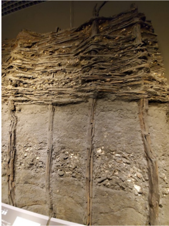
“Slice of Tokyo Bay landfill taken from Shiodome on display at Edo-Tokyo Museum” Photo by author in July 2019.

As Tokyo’s population continued to grow into the 19 th and 20 th centuries, Tokyo Bay continued to shrink as the coastline was built out and new islands emerged. 2 From its natural coastline to the present day, the stages of large-scale land reclamation in Tokyo Bay can be roughly broken down into four periods: 3