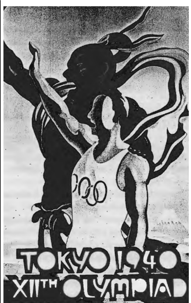
Figure 2. Wada Sanzo, Poster for the 1940 games.

Along with the Olympics, there was another important international event that was planned to take place in Japan that year: The Tokyo Exhibition. It was conceived as a World's Fair, and for this event as well, the state made significant investment. The Wolfsonian in Florida houses a few postcards that portray building plans designed for the occasion (Figure 3). Monumental buildings in these postcards, like the graphic designs for the Olympics, use a modernist visual language that prefers clean lines, geometric abstraction, and minimal decoration, which make the designed buildings resemble the architecture in other