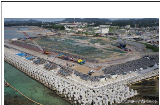
Construction work on the Henoko-side (July 2020).

is not so much directed at the Findings or the DoD’s follow-up activities per se as it is designed to show how the DoD has allowed the flaws of the Okinawa Defense Bureau’s Environmental Impact Assessment (EIA) and the Bureau’s failure to implement critical mitigation measures to undermine and compromise the DoD’s efforts to comply with the U.S. laws and regulations concerning the conservation of the Okinawa dugong. Above all, this critique contends that Henoko-Oura Bay remains critical habitat for the Okinawa dugong population and that the DoD and relevant U.S. federal institutions review the DoD’s commitments to the conservation of the Okinawa dugong in relation to the construction and operation of the base at Henoko-Oura Bay.