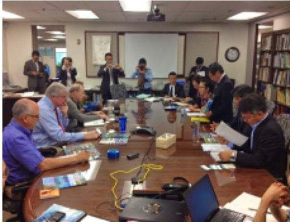
Nago Mayor Inamine Susumu, standing, flanked by Okinawan environmental NGOs, MMC, May 20, 2014